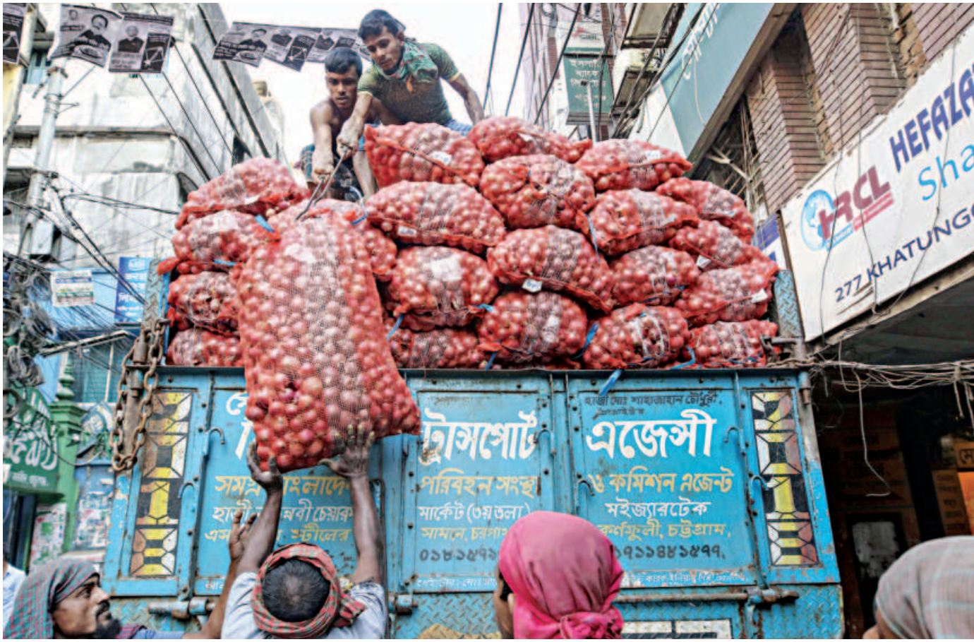
Onion being unloaded at the Khatunganj wholesale market in Chattogram. Onion prices have gone up in both wholesale and retail markets recently piling more pressure on consumers, whose purchasing power has witnessed significant erosion in the past one year.

Announced on the eve of US Independence Day and just before Yellen's planned visit to Beijing from Thursday, analysts said the controls were clearly timed to send a message to the Biden administration, which has been targeting China's chip sector and pushing allies such as Japan and the Netherlands to follow suit.