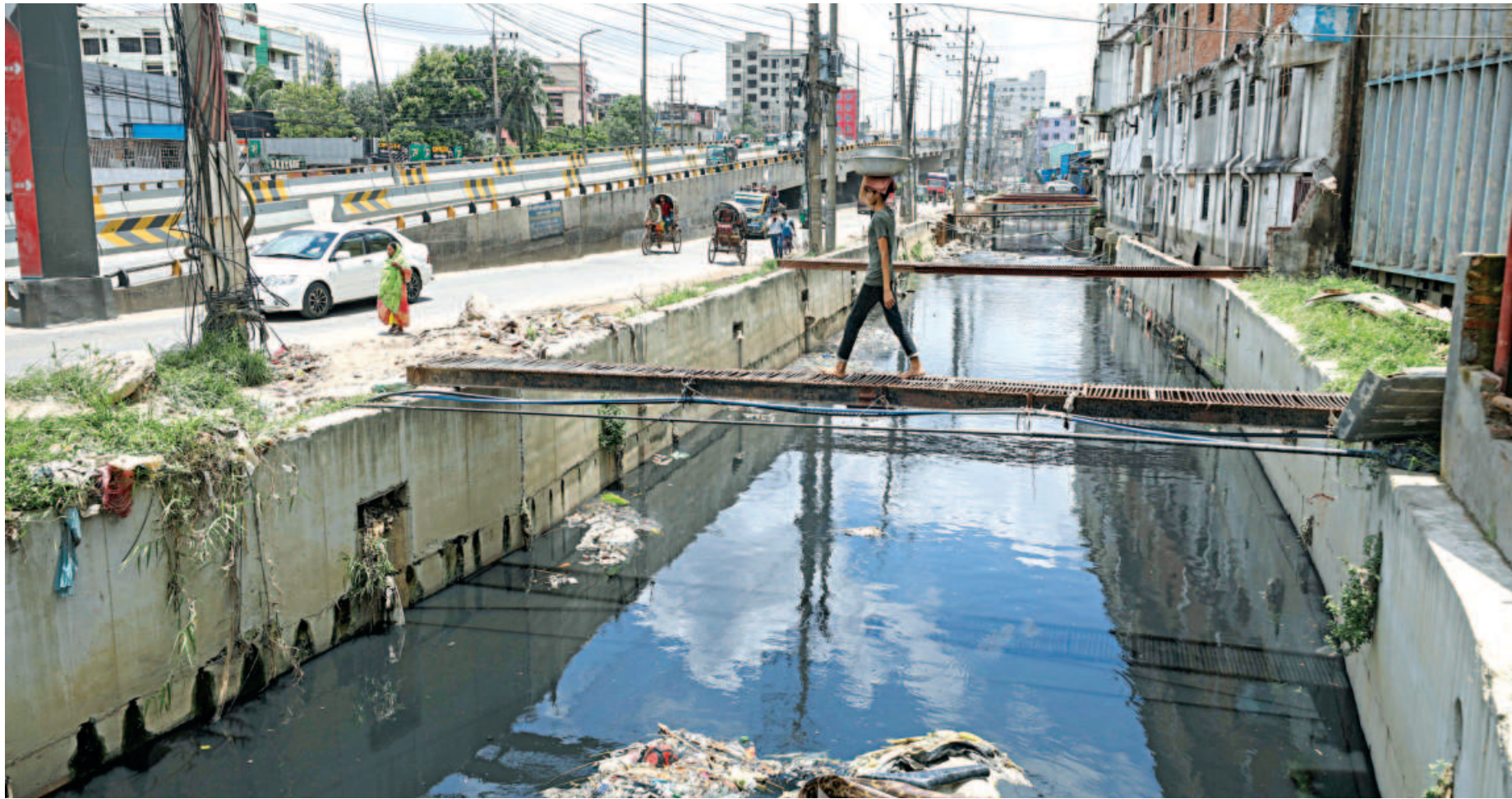
Over the past seven years, at least eight lives have been claimed, while countless others suffered injuries, after falling into these unprotected drains and canals that haunt the port city's streets.