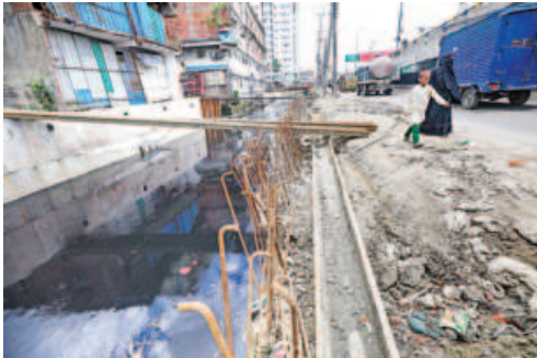
With the ongoing monsoon threatening to exacerbate waterlogging, the residents harbour a collective fear that such tragedies may proliferate once more.