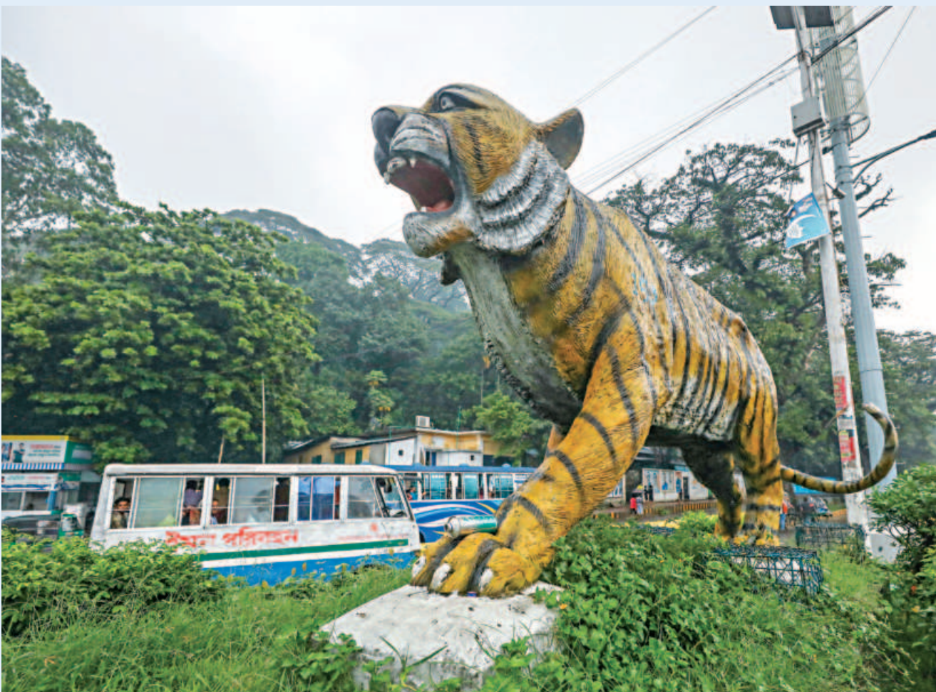
The area was named after tigers as they would make frequent visits while crossing between the two big hills in the area even during the 1900s. Now all that remains is a statue of a tiger.