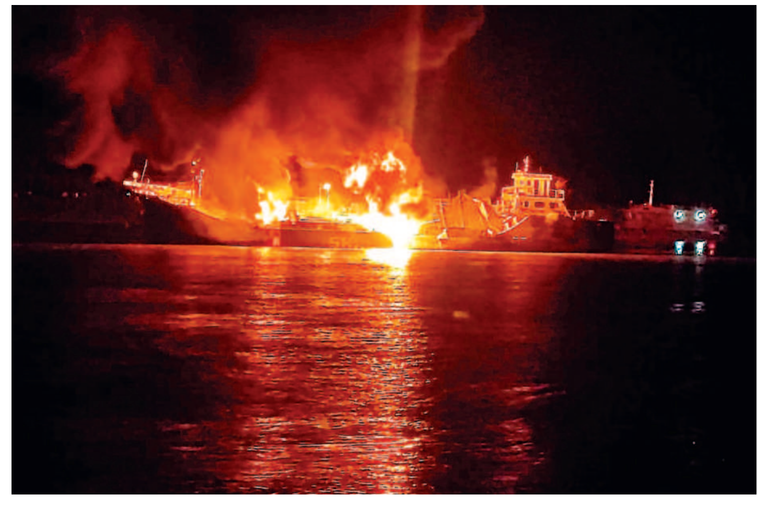
Oil tanker Sagar Nandini-2 on fire for the second time this week on the Sugandha in Jhalakathi yesterday evening. The blast prior to the fire injured 13 including policemen.

In Sunamganj, several thousand people have been SEE PAGE 6 COL 2