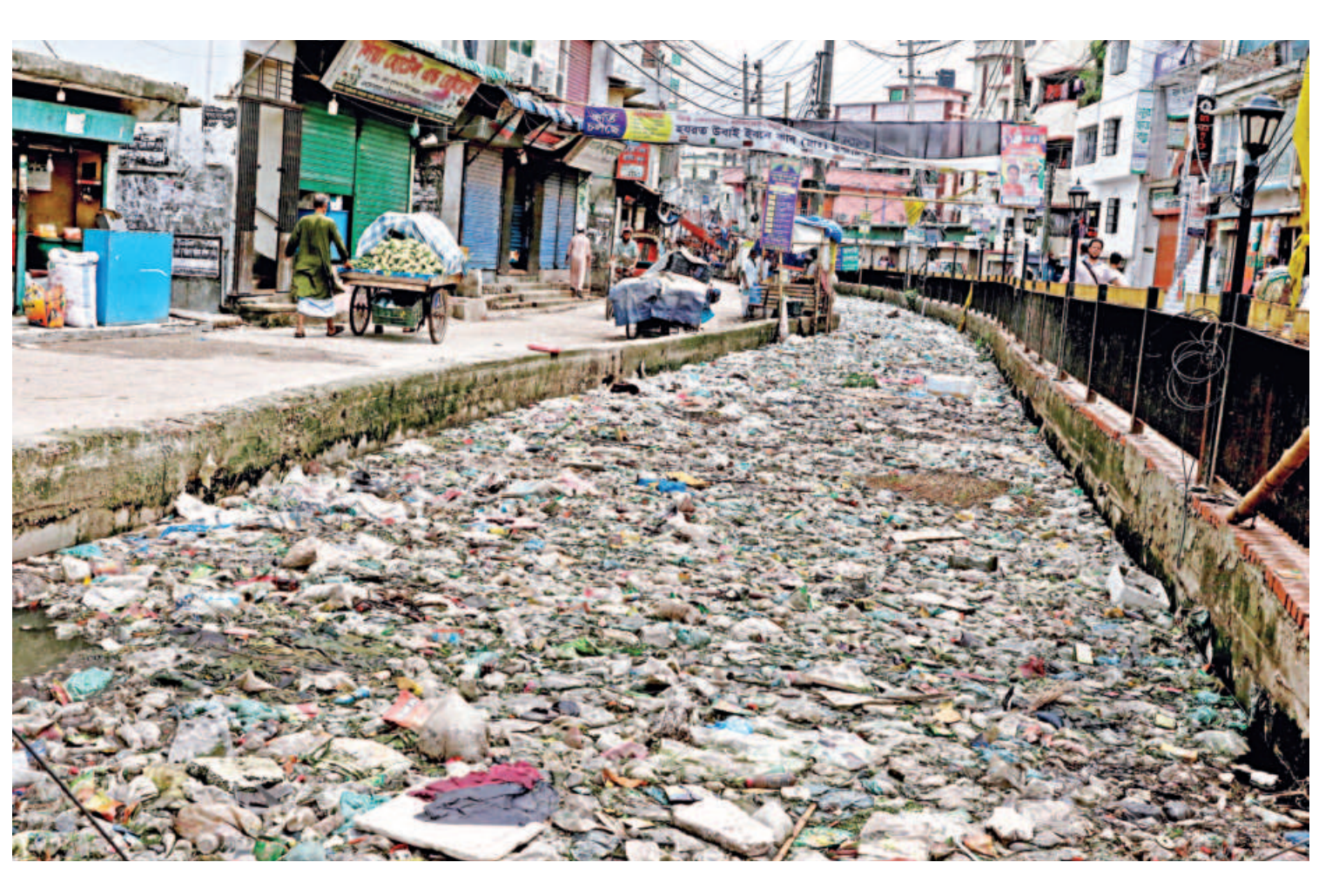
The Kutubkhali canal is clogged with waste in Madrasa Road area of the capital's Dakshin Jatrabari. Many areas in the city remain waterlogged after rain as clogged canals cannot drain water. Uncleaned water bodies also become safe breeding grounds for mosquitoes. The photo was taken on Sunday.

Observations of Baekdu were made using NASA's Transiting Exoplanet Survey Satellite, which studies nearby stars. The team's observations revealed that the star is burning through the supply of helium at its core, since it already appears to have exhausted its hydrogen. The revelation suggests to astronomers that the star once expanded into a red giant star.