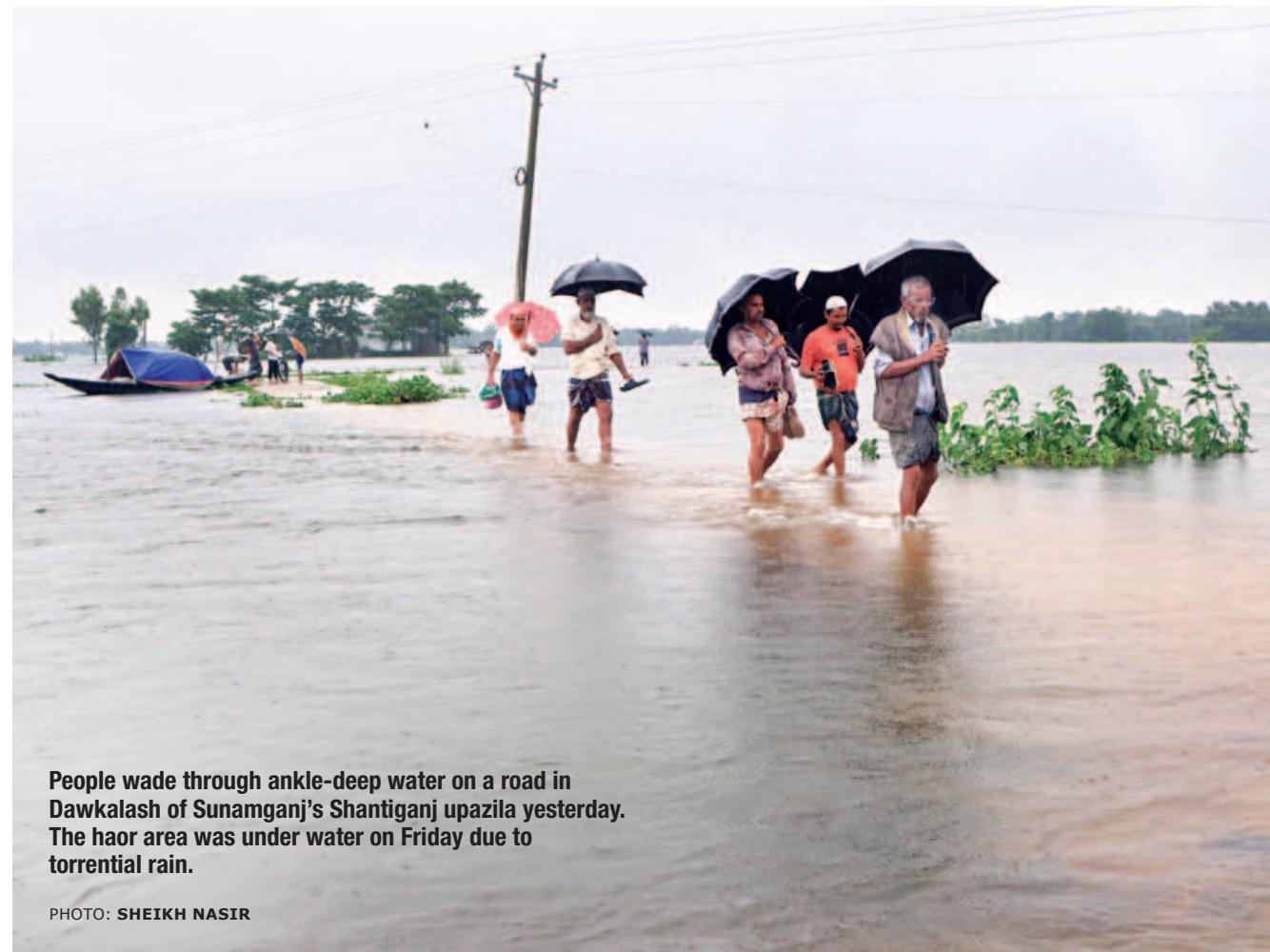
People wade through ankle-deep water on a road in Dawkalash of Sunamganj's Shantiganj upazila yesterday. The hoar area was under water on Friday due to torrential rain.