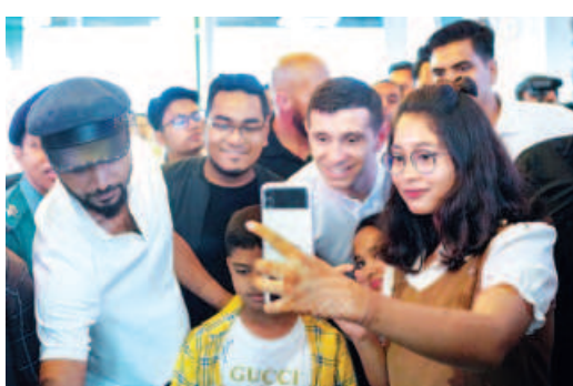
Argentina goalkeeper Emiliano Martinez hands over Prime Minister Sheikh Hasina a jersey during his visit to the PMO yesterday. Former national cricket team captain Mashrafe Bin Mortaza, top, and his children click a selfie with the Argentine football icon, who left Dhaka in the afternoon following a brief visit.