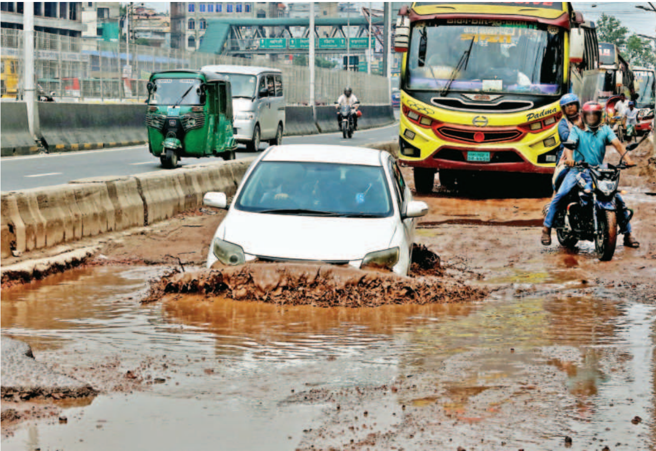
A car appears to plunge into a water-filled crater on Dhaka-Chattogram highway near the capital's Jatrabari. The road has been posing risks to motorists for months, but the bouts of rain over the last few days have made driving even trickier. The pristine road on the left is the approach road to the tolled Mayor Mohammad Hanif Flyover.

The work to expand the Sylhet-Tamabil highway to a four-lane one will finally start around three years after the project was approved, with the goal of improving the country's intercity travel and cross-border connectivity. A Bangladesh-China joint venture firm has been selected for one of the four packages of the Tk 3,583.24-crore project, the physical or civil work of which is expected to begin in September. But the delay in land acquisition, like many other projects, may hinder the implementation of the project, which is already running behind schedule, said officials of the Roads and Highways Department (RHD), the implementing agency of the project. In September 2020, the Executive Committee of the National Economic Council (Ecne) approved the project for expanding 56.16km of the two-lane Sylhet-Tamabil highway into four lanes with service lanes on both sides. The Asian Infrastructure Investment Bank (AIIB) will provide Tk 2,970.56 crore as a loan, while the government will cover the rest of the cost. The deadline for the project is June 2025. The Sylhet-Tamabil highway is a part of the Asian Highway-1 which links India's Meghalaya and West Bengal through Tamabil - Sylhet - Kanchpur - Dhaka - Jashore - Benapole. RHD is implementing another project to expand the Dhaka-Sylhet