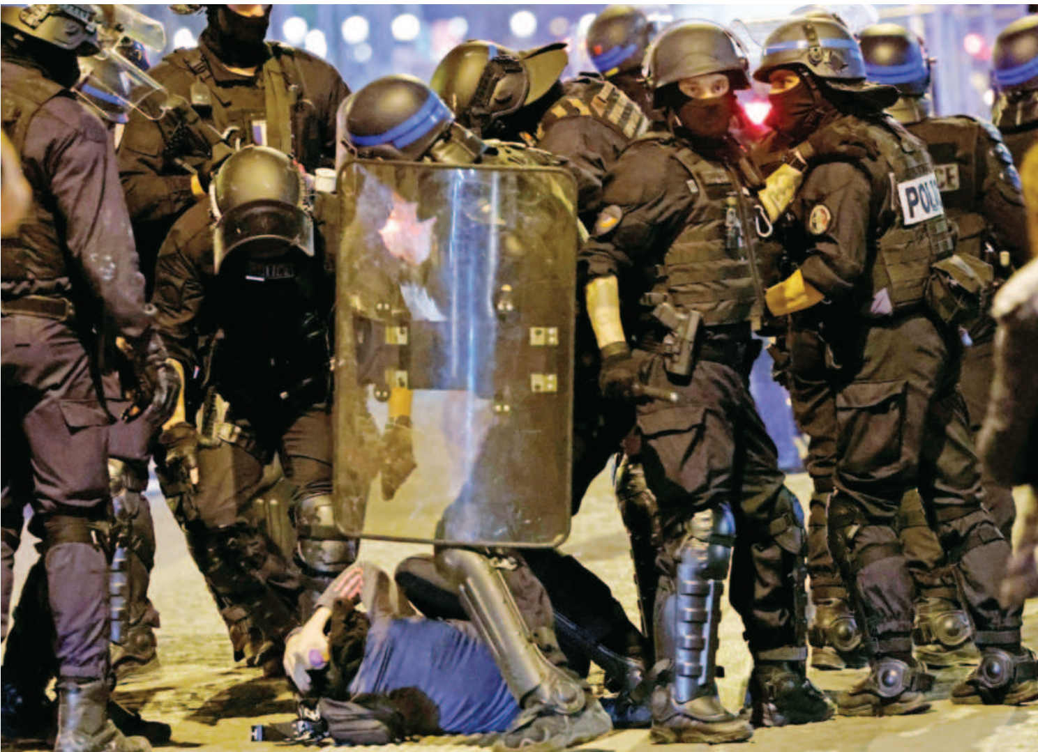
French police officers detain a demonstrator in Paris yesterday, five days after a 17-year-old boy was killed by police in Nanterre, a western suburb of Paris. French police arrested 1,311 people across the country during a fourth consecutive night of rioting over the killing of the teenager.