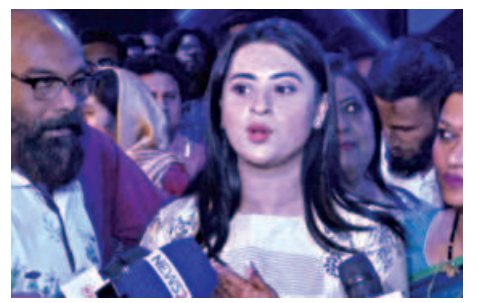
Bubly attends the premiere of "Prohelika".

with no tickets left in multiplexes. The film is dominating both the screens with audiences even turning back due to lack of tickets.