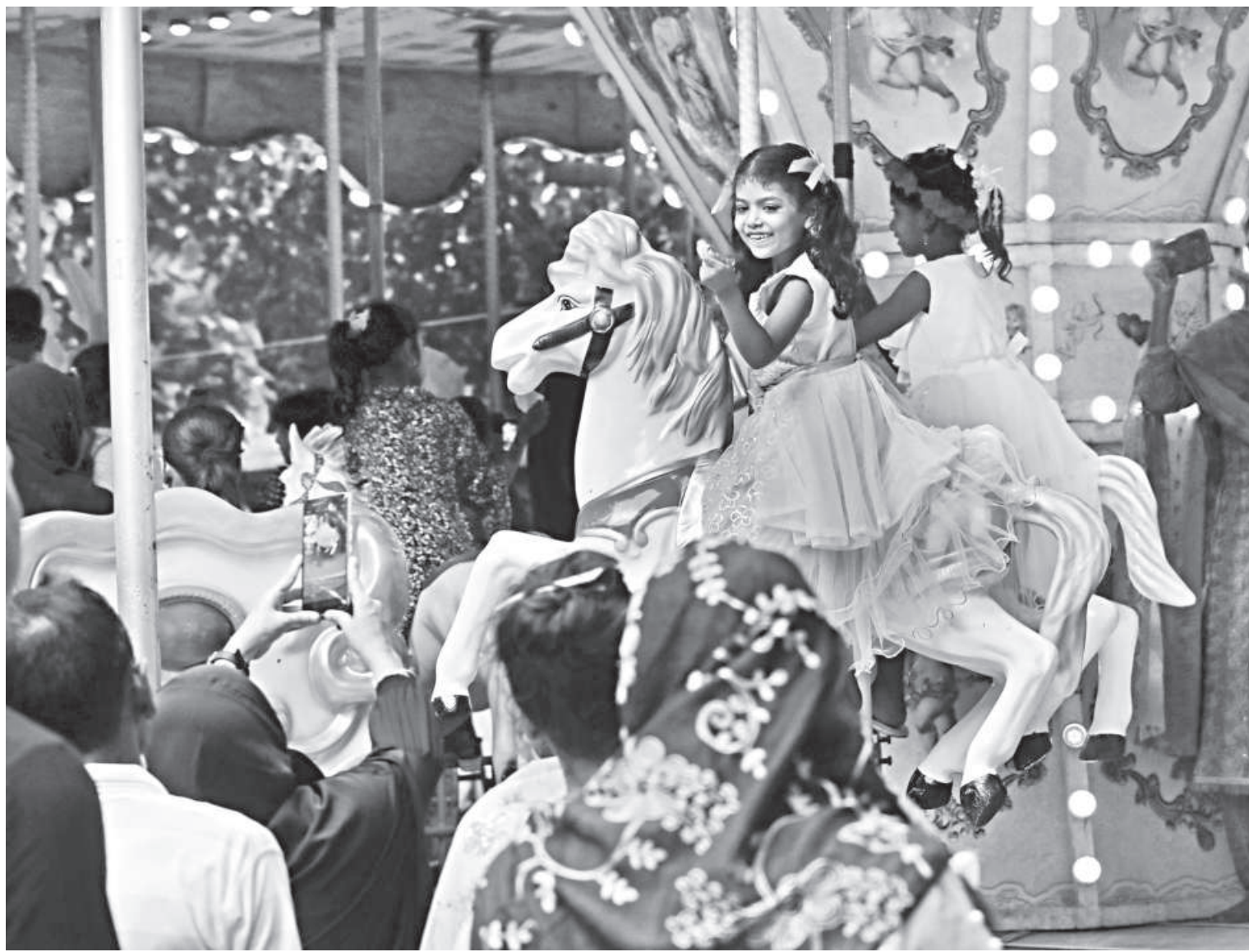
CELEBRATING EID... Taking a break from monotony, children were seen enjoying Eid with their parents at different amusement parks and tourist places around the country. While some chose to book a trip on a carousel, others enjoyed the day making friends with animals at the zoo. Meanwhile, many others decided to take a dip in the sea or relish the rain. The photos were taken from National Zoo in the capital's Mirpur, Chattogram's Patenga Beach and Sylhet's Sada Pathar area.