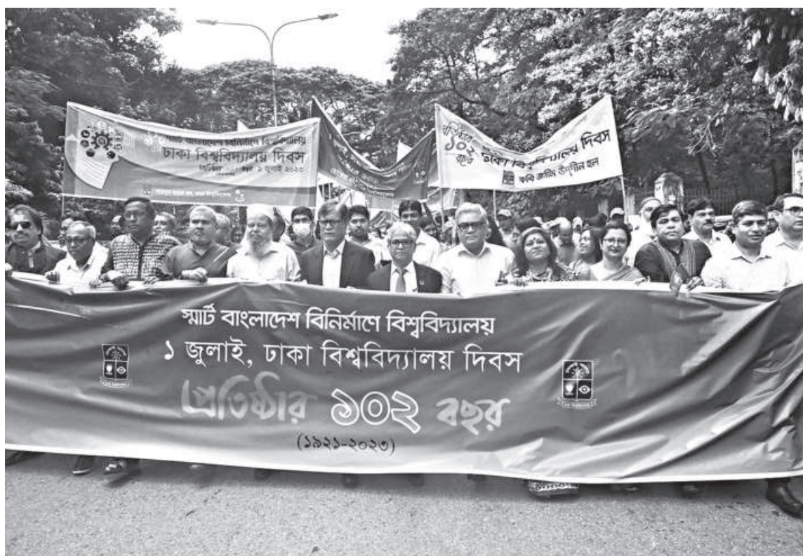
Marking the 102nd founding anniversary of Dhaka University, a procession, led by the university's former and existing students, teachers and staff, was brought out on the campus yesterday.

PRAYER TIMING JULY 2 Fazr Zohr Asr Maghrib Esha AZAN 4-10 12-45 5-00 6-55 8-17 JAMAAT 4-45 1-15 5-15 7-00 8-45 SOURCE: ISLAMIC FOUNDATION