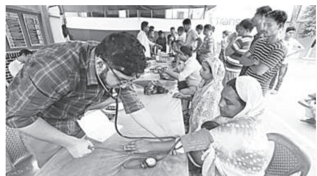
Doctors conduct medical check-up of Bogura residents, as part of a camp organised by Faraaz Hossain Foundation yesterday.