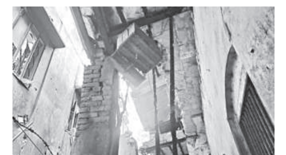
The balcony of this building, which houses a police outpost, collapsed in Bangshal on Friday.