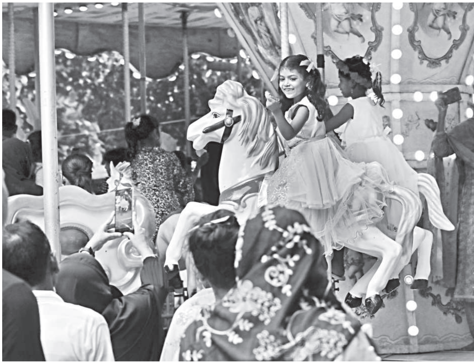
CELEBRATING EID... Taking a break from monotony, children were seen enjoying Eid with their parents at different amusement parks and tourist places around the country. While some chose to book a trip on a carousel, others enjoyed the day making friends with animals at the zoo. Meanwhile, many others decided to take a dip in the sea or relish the rain. The photos were taken from National Zoo in the capital's Mirpur, Chattogram's Patenga Beach and Sylhet's Sada Pathar area.