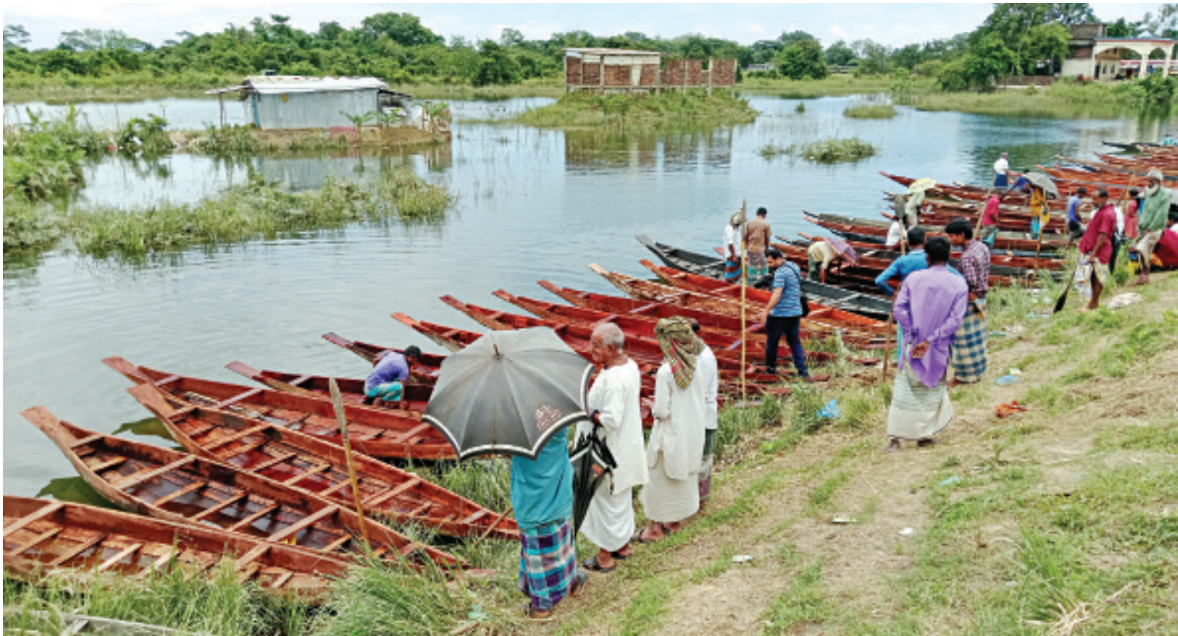
These boats on display at Salutikar Bazar are for sale. The demand for boats increases in the rainy season as it becomes the main mode of transport for the people of the haor regions during the time. Boat prices range between Tk 3,000 and Tk 10,000. This around 100-year-old market in Sylhet's Gowainghat remains open on Saturdays and Tuesdays. The photo was taken yesterday.