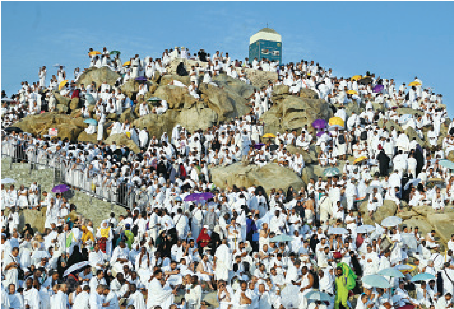
Muslim pilgrims crowd Saudi Arabia's Mount Arafat, also known as Jabal al-Rahma or Mount of Mercy, during the climax of the Hajj pilgrimage yesterday.