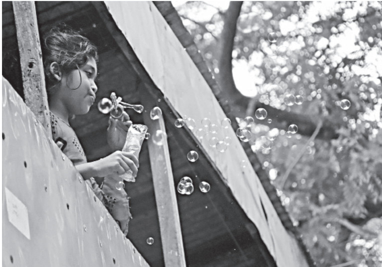
SIMPLE JOYS OF LIFE... A girl plays with bubbles in her balcony in Barishal city's Chadmari area. Her face lights up as she dips one end of a pipe into soap water and blows through it to shoot bubbles into the air.