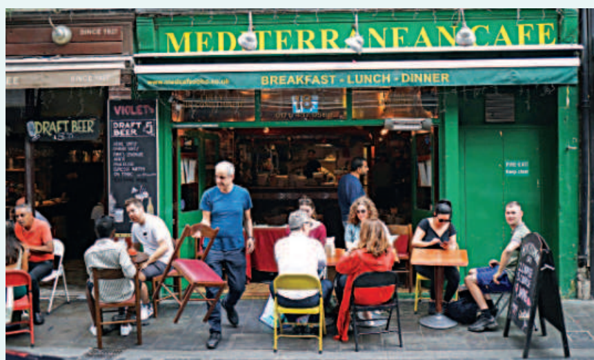
Customers eat and drink outside a cafe in the Soho area of London on June 18. Recent data showed UK inflation slowed to a 13-month low in April, but remains elevated at 8.7 per cent amid soaring food prices.

"While headline inflation has eased significantly, inflation in services has stayed high, and the date by when it is