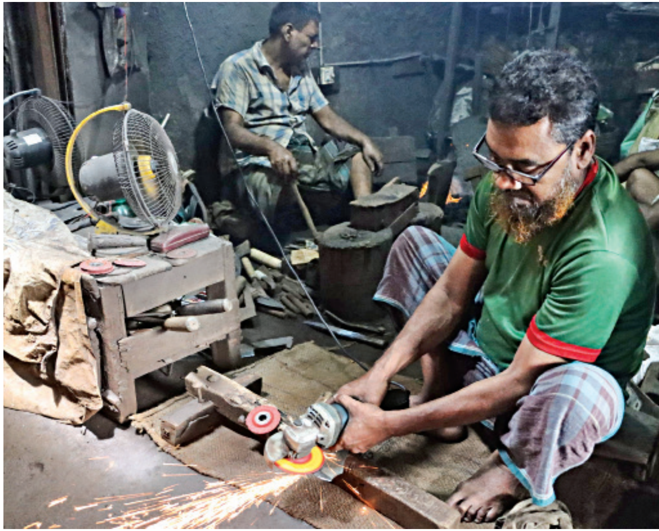
With Bangladesh set to celebrate Eid-ul-Azha tomorrow, blacksmiths across the country are sharpening the knives, hatchets and other instruments that will be used to butcher the meat of sacrificial animals. The picture was taken from the Hathkhola area of Barishal city on Monday.

On the other hand, all 392 factories under the Bangladesh Export Processing Zones Authority have paid the festival bonus.