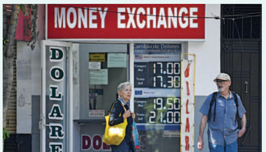
A woman walks past a money exchange in Mexico City on June 23.