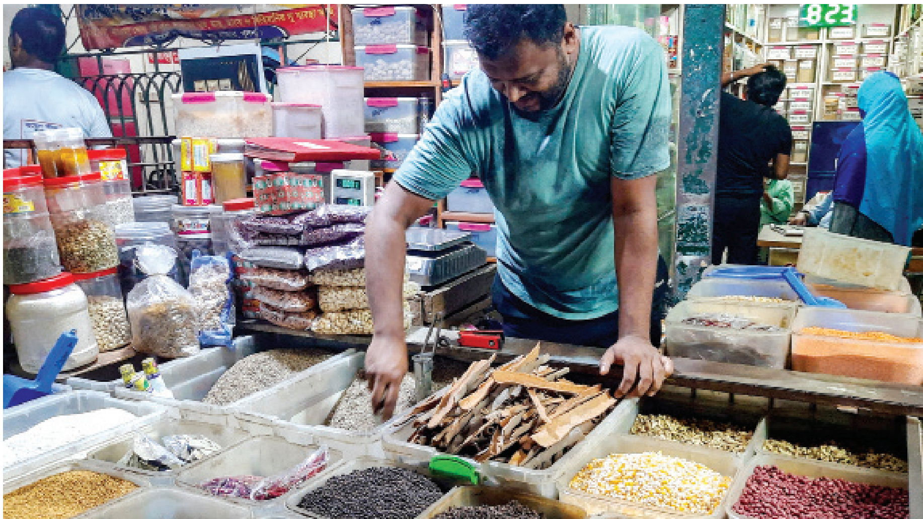
Shopkeepers all over the country are selling an array of spices on the occasion of Eid-ul-Azha, when people will prepare various dishes with the meat of their sacrificial animals. The picture was taken from Boro Bazar in Khulna city on Monday.