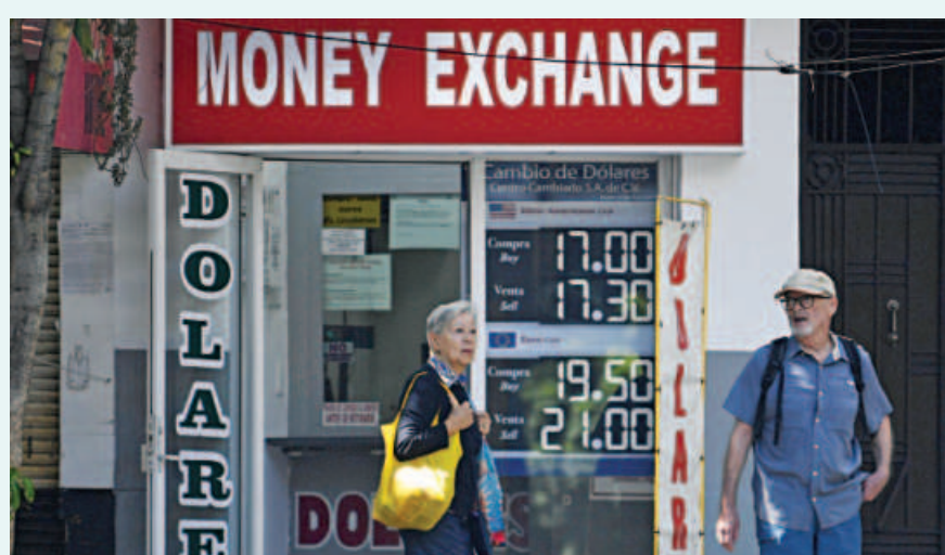
A woman walks past a money exchange in Mexico City on June 23.