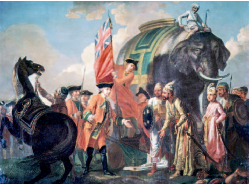
Clive meeting Mir Jafar after the Battle of Plassey, oil on canvas (Francis Hayman, c.1762)