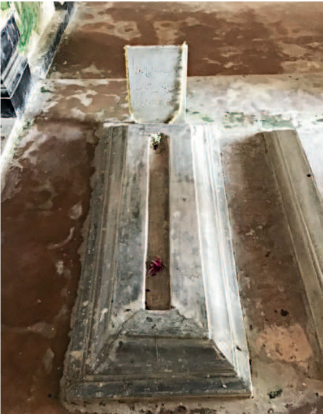
Tomb of Siraj ud-Daulah