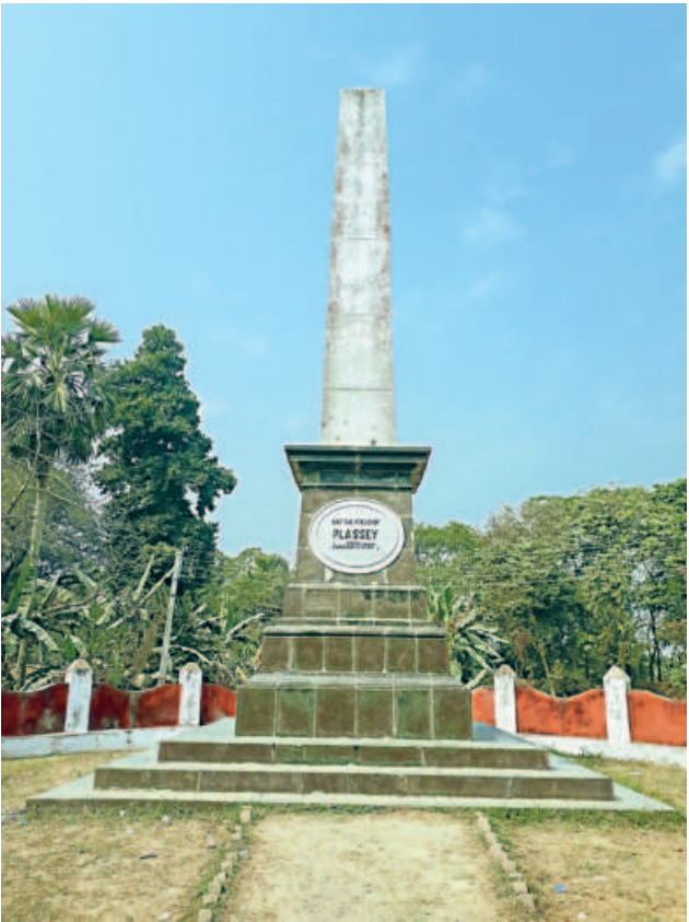
Plassey Monument in the battlefield

The Battle of Plassey is one of the grimmest examples, in modern recorded history, not necessarily of the birth of colonial rule (as most others would claim) but of the episodic phenomenon of South Asians defying the interests of their own imagined community to betray the reins of their statecraft to Machiavellian magnates.