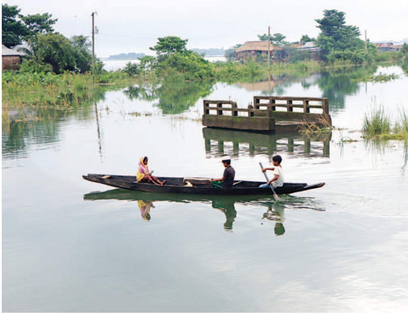
Three children take a boat ride to their home after attending Arabic lessons at a mosque in Borni area of Sylhet's Companiganj upazila. The area went under water about 10 days ago due to rain and onrush of water from upstream.