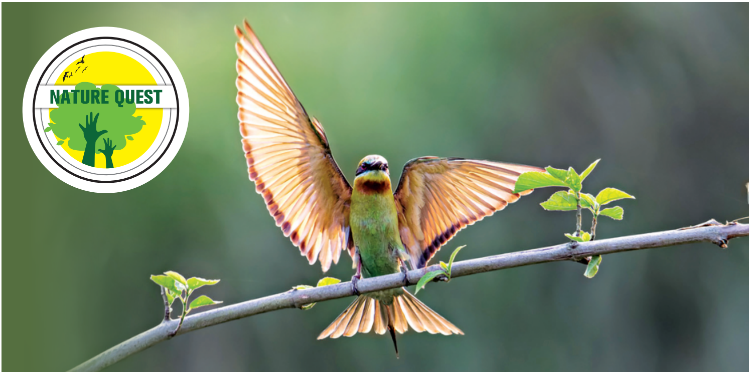
A blue-tailed bee-eater, locally known as Shuichora, stretches its wings on a branch at Arakul in Dhaka's Keraniganj. This species, like other bee-eaters, is a richly coloured slender bird. It is predominantly green. Its face has a narrow blue patch and a black eye stripe. The bird is seen mostly in open habitats close to water.