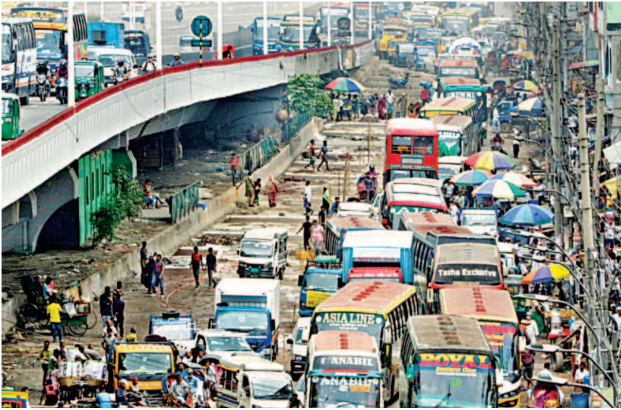
Congestion at Jatrabari intersection under the Mayor Mohammad Hanif Flyover around noon yesterday. Slow repair work on the road has made things worse.