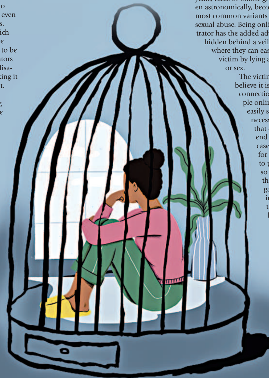
ILLUSTRATION: FATIMA JAHAN ENA

who gave them can be an indicator of grooming. Another sign could be a child showing an inexplicable interest towards a particular person, and/or showing diminished desire to partake in activities they previously enjoyed. In the past, if the child had a friendly relationship with their family or friends and regularly shared details of their life with their close ones but are suddenly very uncommunicative, it might be time to have a conversation with them.