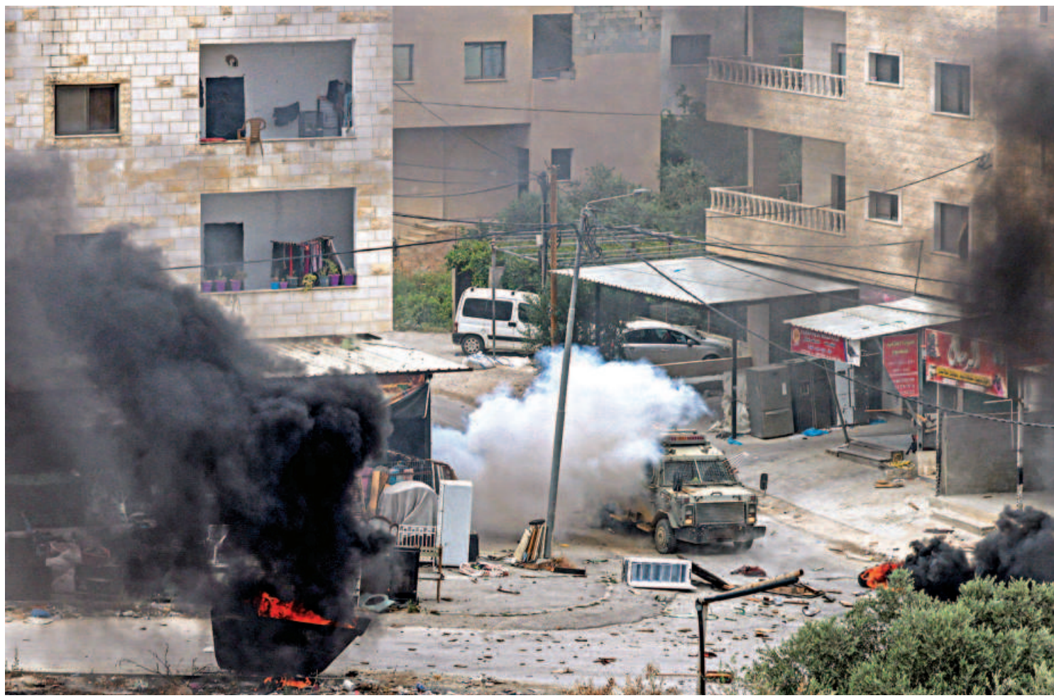
An explosive charge left by Palestinians detonates by an Israeli armoured vehicle during an Israeli army raid in Jenin in the occupied West Bank yesterday. Israeli forces killed five Palestinians including a militant yesterday, in the raid that saw seven Israeli security personnel wounded and rare helicopter fire.

The UN has two appeals for tackling the crisis – the humanitarian response within Sudan, and the refugee response outside its borders. The appeals need $3 billion this year, but are less than 17 percent funded so far. At the conference, Qatar pledged $50 million and Germany $200 million in Sudan aid.