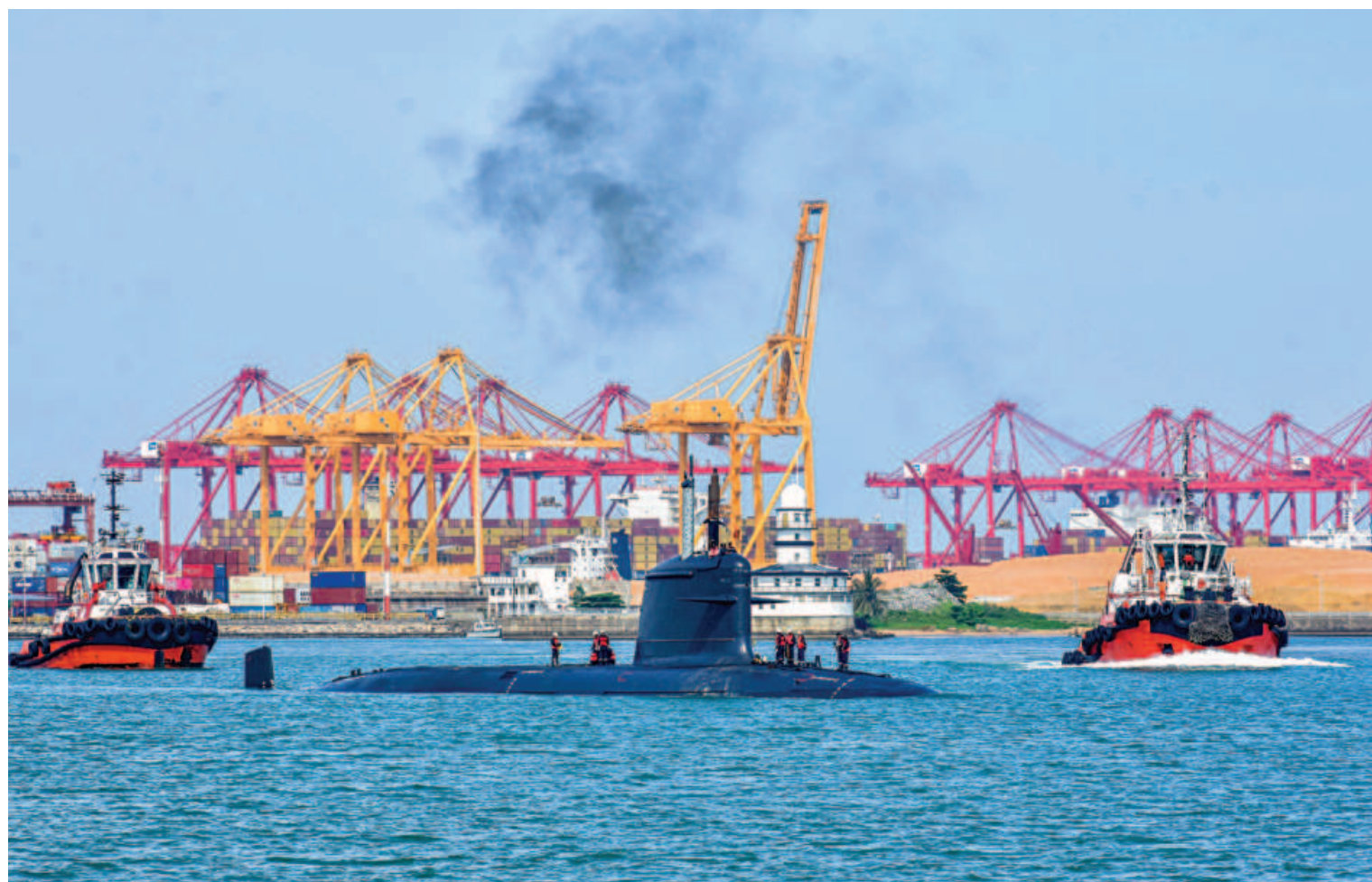
This handout photo released by the Sri Lanka Navy yesterday, shows Indian naval submarine "INS Vagir" entering the Colombo harbour on a formal visit. The Indian High Commission in Colombo said the three-day visit is to commemorate the 9th International day of Yoga "under the theme of Global Ocean Ring."

In Europe, high temperatures "exacerbated severe and widespread drought conditions, fuelled violent wildfires that resulted in the second largest burnt area on record, and led to thousands of heat-associated excess deaths," said WMO chief Petteri Taalas.