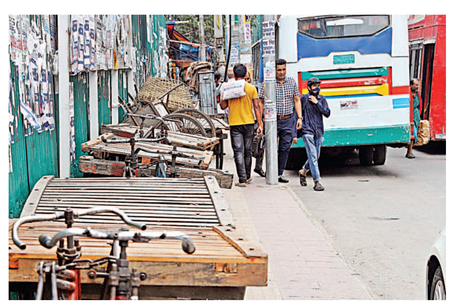
With rickshaw-vans occupying most of this footpath on Kazi Nazrul Avenue, commuters are forced to walk across the narrow space left for them. This photo was taken yesterday in Karwan Bazar area.