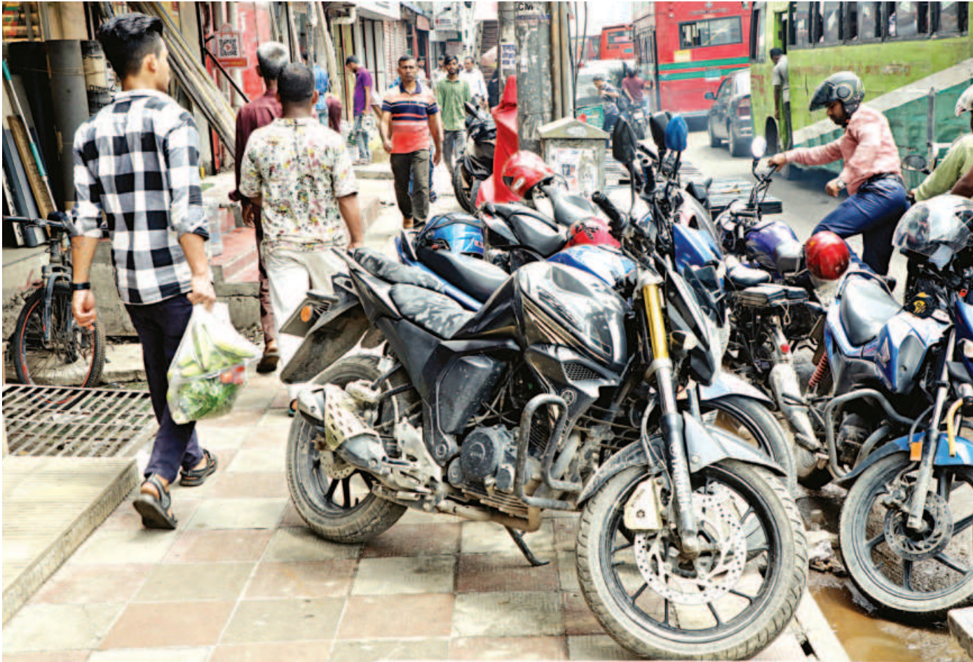
Motorcycles parked illegally on the pavement leave little space for pedestrians. The photo was taken yesterday from the capital’s Chairman Bari area.

As the first US secretary of state to visit China in five years, Blinken held “candid, substantive, and constructive talks” with People’s Republic of China (PRC) State Councilor and Foreign Minister Qin Gang, a State Department spokesman said. Before the talks, US officials saw little chance of any breakthrough on the long list of disputes between the world’s two largest economies, which range from trade and US efforts to hold back China’s semiconductor industry SEE PAGE 6 COL 2