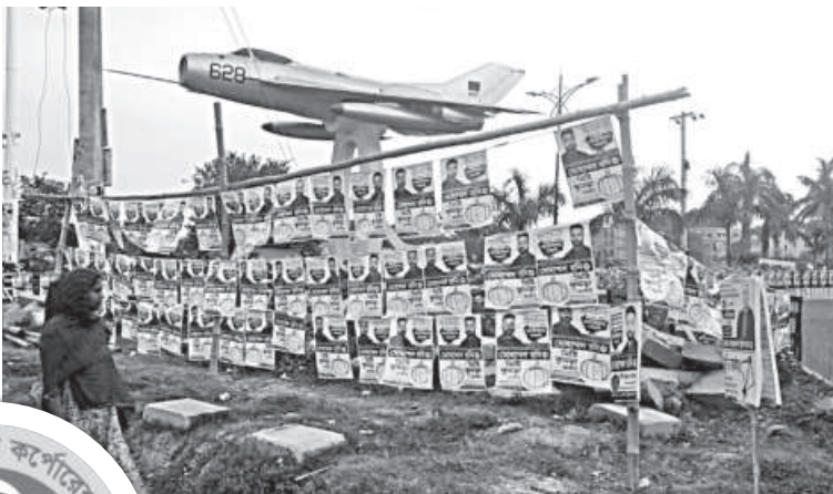
A woman looks at posters of various councillor candidates hung on a makeshift bamboo platform in Rajshahi city.

More than 50 candidates from the ruling Awami League are contesting each other at 19 of total 30 wards. As a result, the candidates and their supporters are at loggerheads in the wards.