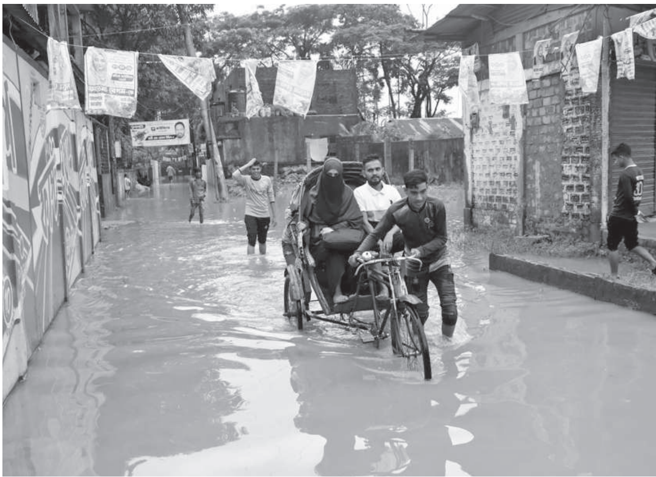
Continuous rains for the past several days have caused waterlogging in the low-lying areas of Sylhet city. Meanwhile, mayoral candidates carry on with their campaigns with promises to mitigate this perennial crisis, if elected. The photo was taken yesterday in the city's Moiarchor area.