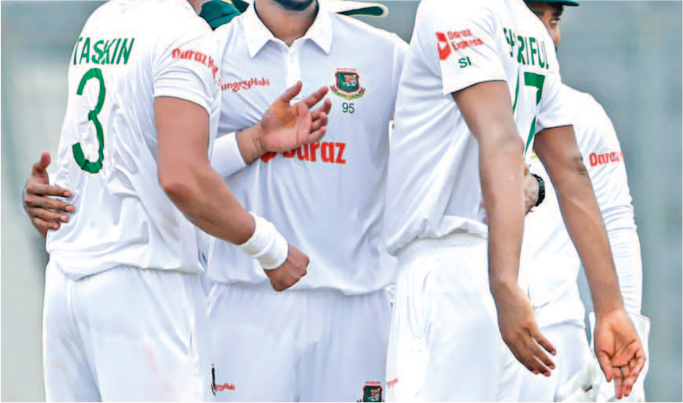
The pace trio of Taskin Ahmed, Ebadot Hossain and Shoriful Islam were all smiles on Saturday, and they had good reason for it. The Bangladesh quicks accounted for a total of 14 wickets in the one-off Test against Afghanistan, which the Tigers won by a record margin of 546 runs on Day 4 in Mirpur yesterday.