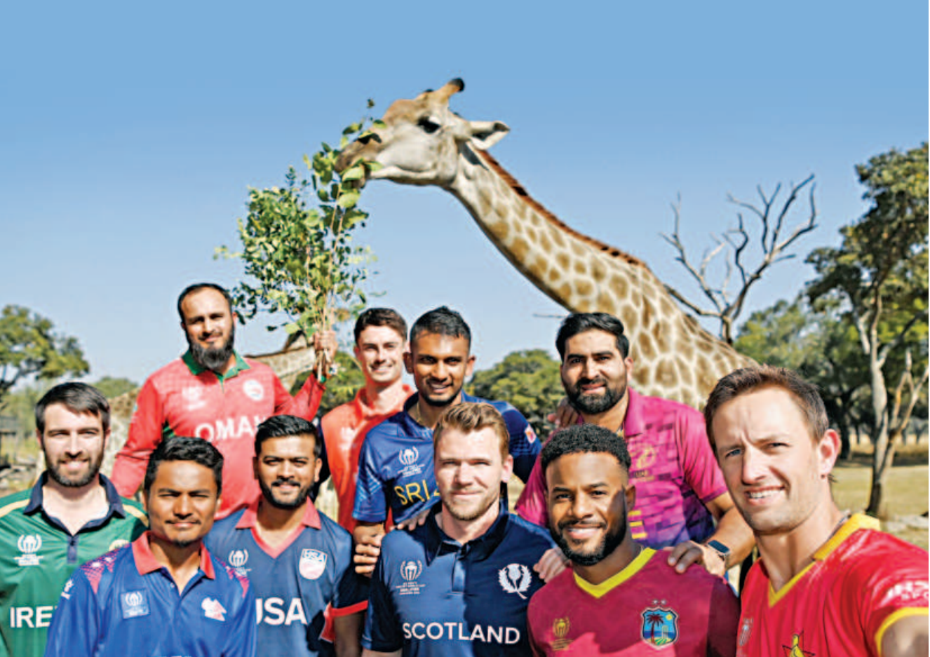
Captains of 10 teams came together to experience Zimbabwe’s local wildlife at the Wild is Life sanctuary in Harare ahead the ICC Men’s Cricket World Cup Qualifier, which is set to begin today. The event will run from 18 June to 9 July and two teams will eventually qualify for this year’s World Cup in India. Hosts Zimbabwe take on Nepal while West Indies face United States in the two matches on the opening day.

triumph against hosts Netherlands, one step closer towards that elusive “gold”. There are some reports Modric may retire from international duty after the Nations League but the player said he would decide his future after the tournament. “I always enjoy playing for the national team, it’s not because it could be my last competition or my last match,” said Modric. “Every single match, every training session is a joy. As long as I feel I can help, there’s no reason for me not to be here.” The Croatian midfield maestro pulled the strings for his country, getting the better of Barcelona’s Frenkie de Jong, but Manchester City’s Rodri will provide an even sterner test. City’s Champions League final hero is the key piece in Luis de la Fuente’s La Roja, who are still finding their footing. Joselu’s last winner to help them beat Italy in Enschede calmed the storm around Spain and they can end a trophy drought of over a decade, with their last triumph coming in Euro 2012. “It will be very important to win again, after all this time, bringing Spain back to the highest point,” Rodri told a news conference Saturday. “It’s not just important to win but to create a winning culture, we have to understand that we have a unique opportunity.”