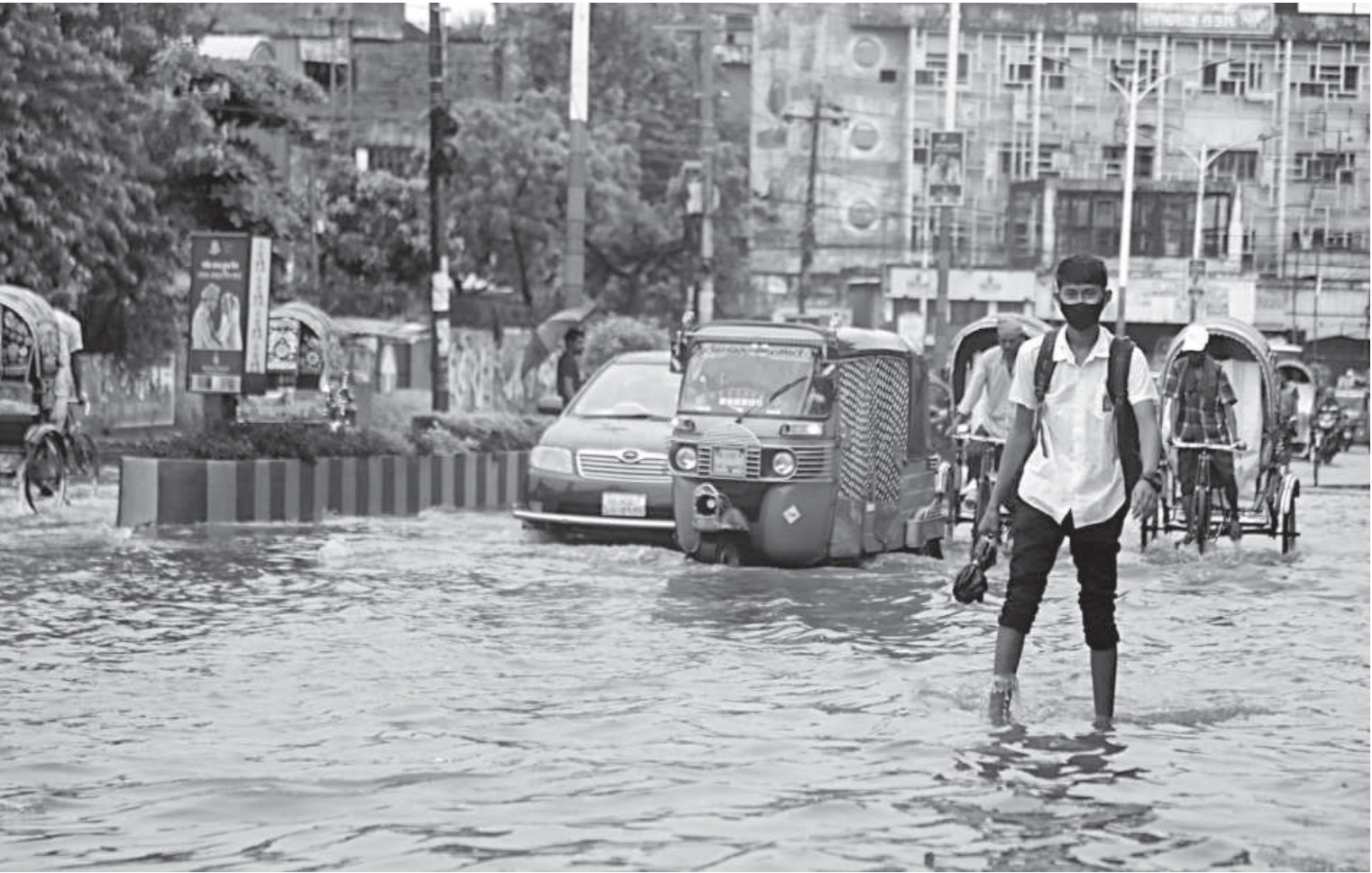
All it needed was 11mm rain from noon to 3:00pm that submerged many of the low-lying areas in the port city yesterday. Due to waterlogging, many vehicles got stuck on the road while water entered the ground floors of residents and markets, causing immense sufferings to people. This photo was taken in Sholashahar Gate-2 area.