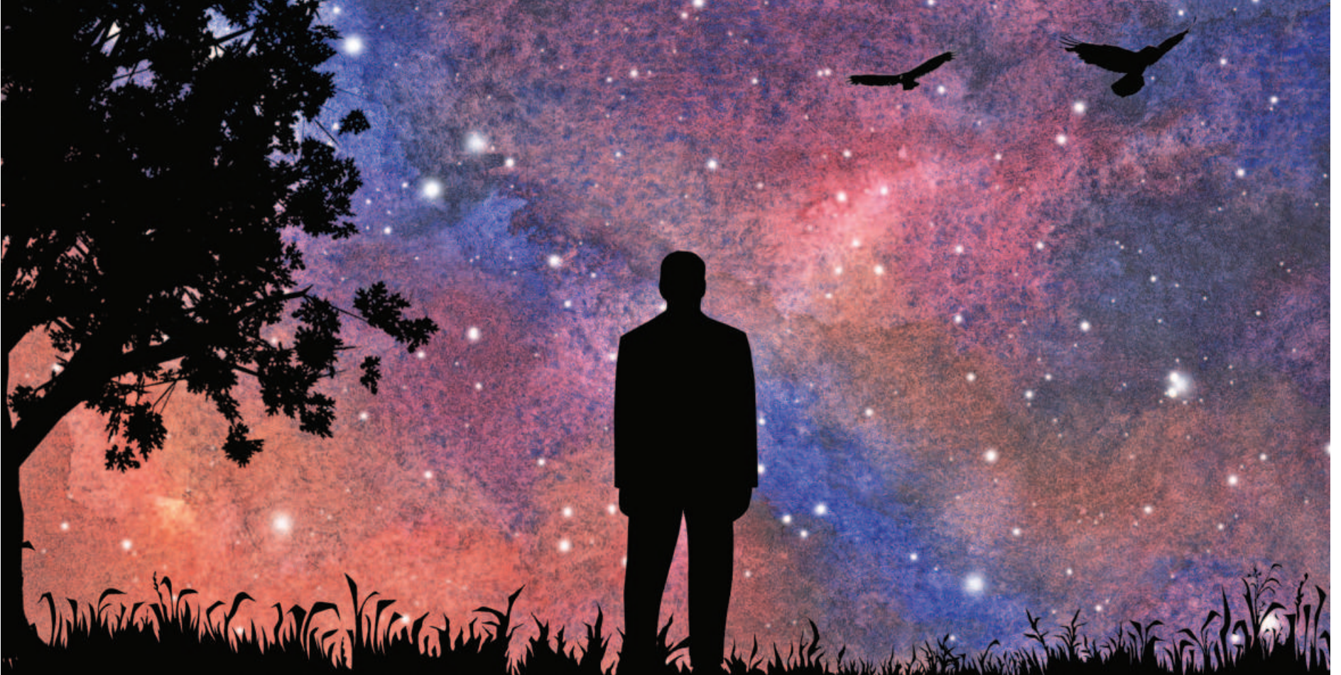
ILLUSTRATION: SYEDA AFRIN TARANNUM