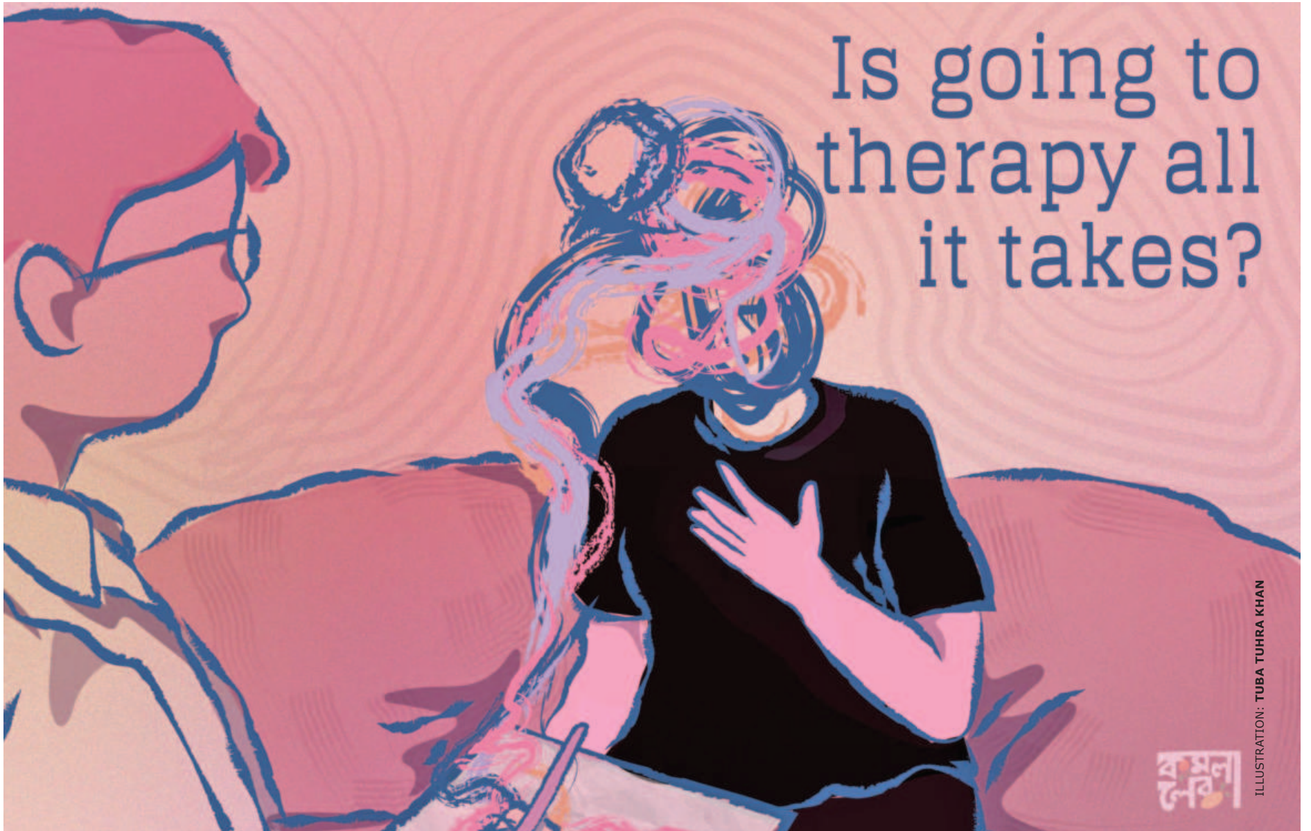
ILLUSTRATION: TUBA TUHRA KHAN