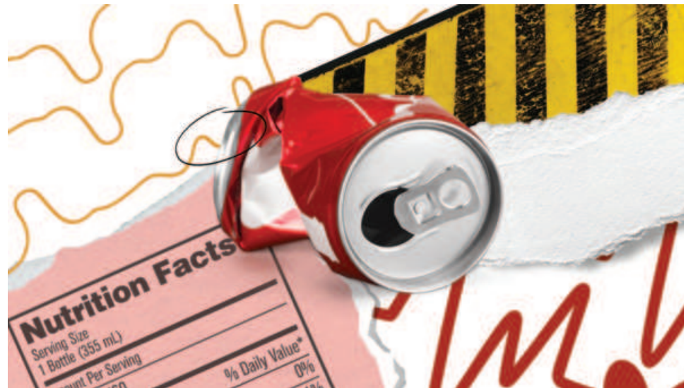
ILLUSTRATION: ABIR HOSSAIN