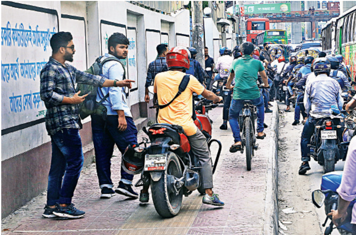
Two pedestrians call out a biker after he hops onto a walkway with his motorbike to avoid being stuck in traffic near the Banglamotor signal. This scenario has become quite common in the capital due to significant increase in the number of bikes. This photo was taken yesterday afternoon.