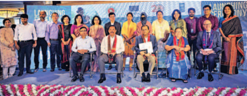
Guests and speakers at the event yesterday.

MJF launches UNDP, EU-funded project in CHT