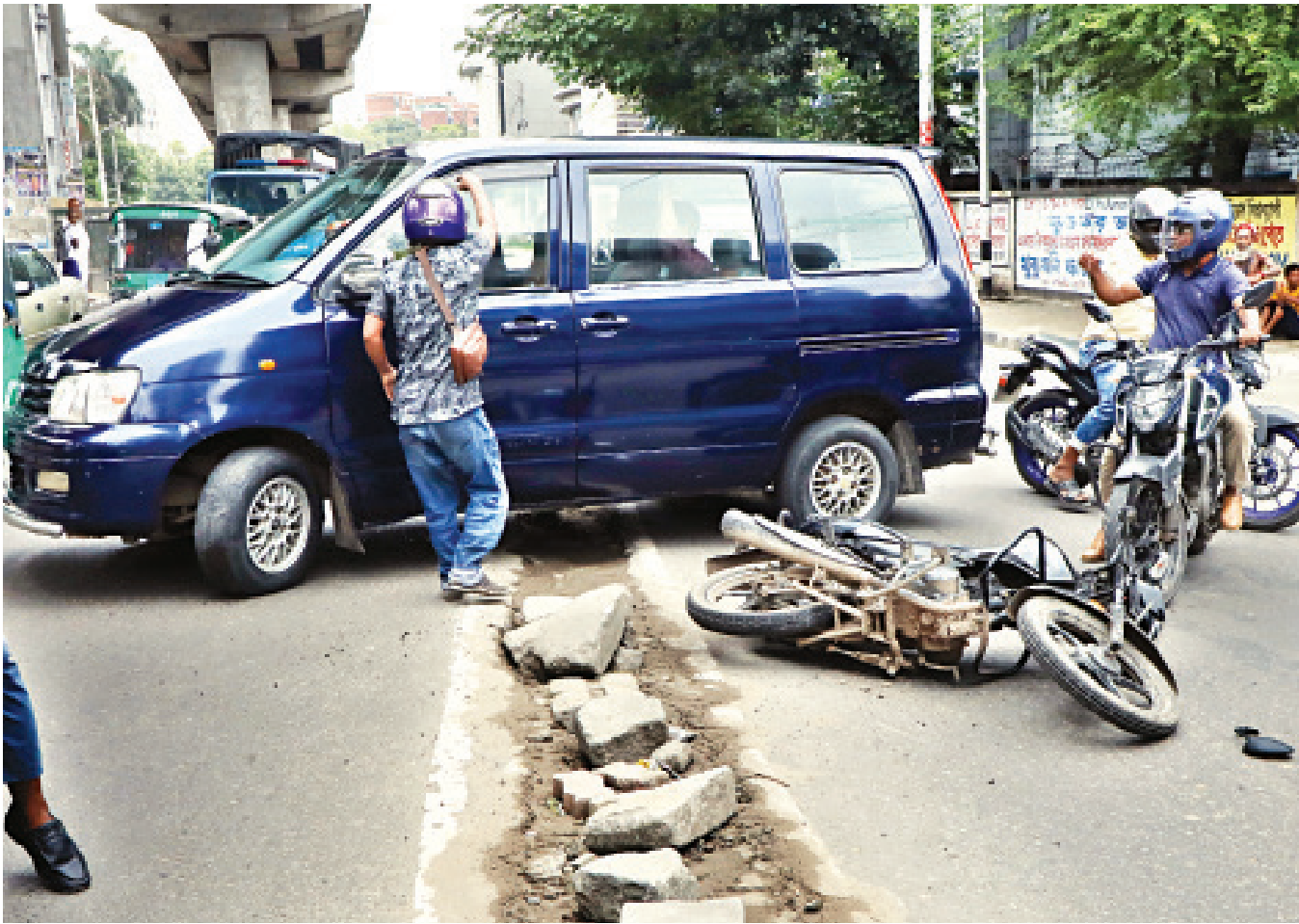
Moments after a microbus, going against traffic, rammed a motorcycle and injured its rider near Sat Rasta yesterday morning. Motorists later made sure that microbus driver did not leave the scene before traffic police arrived.