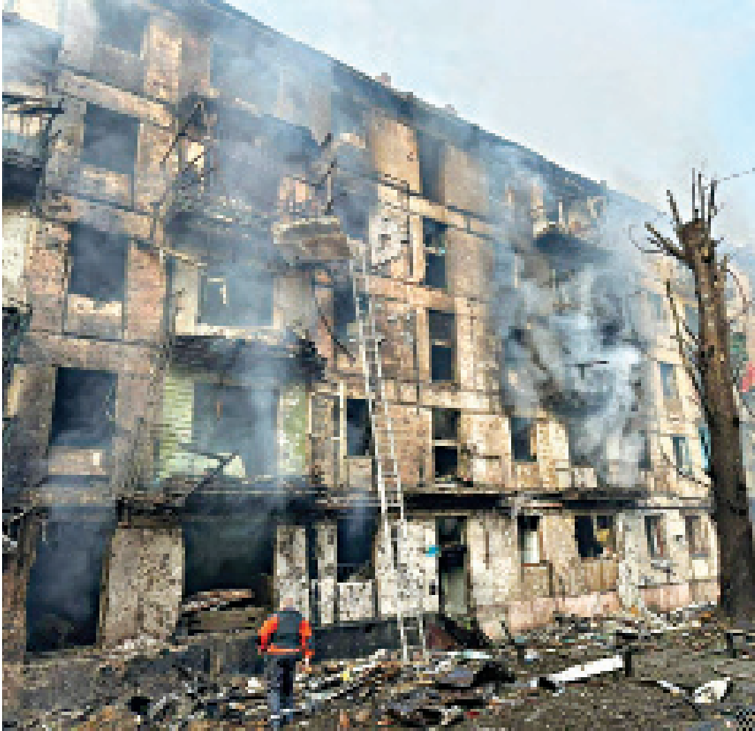
A view shows a residential building heavily damaged by a Russian missile strike, amid Russia's attack on Ukraine, in Kryvyi Rih, Dnipropetrovsk region, Ukraine yesterday.