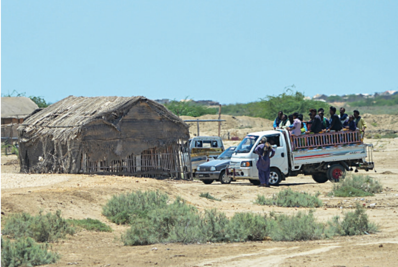
Villagers travel over a truck to government relief camps before the onset of cyclone, in Sujawal district, Sindh province, Pakistan yesterday. A cyclone is making its way across the Arabian Sea towards the coastlines of Pakistan and India, expected to make landfall on June 15.

AFP, Seoul A British man was arrested in South Korea yesterday after he attempted to climb the country’s tallest skyscraper – the fifth highest in the world – without equipment, police said. The man was scaling the 123-storey Lotte World Tower in southern Seoul early yesterday when staff spotted him, forcing him to stop his ascent as he reached the 73rd floor. “Lotte staff had to go on a gondola lift to persuade him to stop when he was still climbing above the building’s 70th floor,” an official from the National Police Agency told AFP.