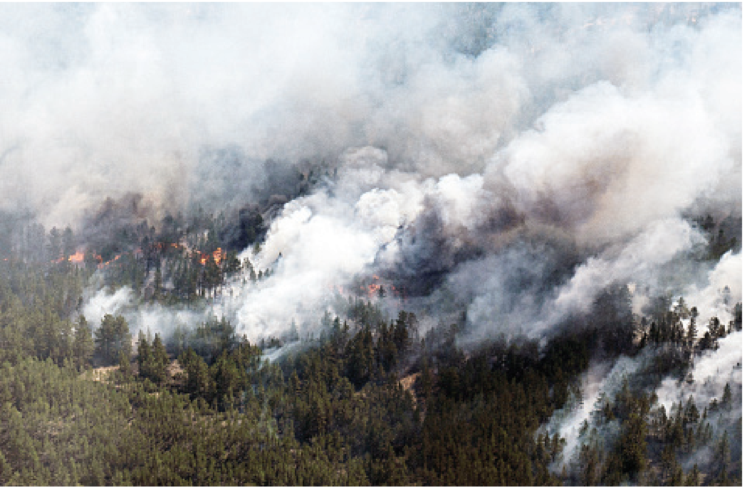
An aerial view shows smoke from wildfires rising above a forest belt in the eastern Abai region, Kazakhstan yesterday. Flags were lowered across Kazakhstan yesterday as the country mourned 14 forestry workers killed in the wildfire in Abai region. Firefighters were still struggling to contain the blaze raging across 43,000 hectares of land in the Central Asian nation, the government said.

perspective, turning the beautiful vision of cooperation between the two countries into concrete results”. Castro is expected to sign a host of agreements during her visit. In March, Honduras cut diplomatic ties with Taiwan in favour of Beijing, reducing the number of countries that diplomatically recognise Taipei to just 13. China opened an embassy in Tegucigalpa last week. China also encourages Chinese enterprises to participate in Honduras’ projects in areas including energy, infrastructure and telecommunications, CCTV cited a joint declaration as saying. The Chinese leader also emphasized that both sides should deepen political mutual trust, and uphold the “One-China” principle, reports Reuters. “One-China principle is the primary premise and political foundation for the establishment of loyal diplomatic relations and the development of bilateral relations,” Xi said. When Honduras ended its decades-long relationship with Taiwan, the island’s foreign minister accused it of demanding exorbitant sums before being lured away by Beijing.