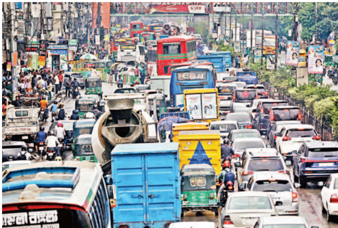
Vehicles remain stuck in a long tailback on the Airport road yesterday afternoon. Though traffic congestions have become a norm in the capital, especially on weekdays, the morning rain only exacerbated people's sufferings. This photo was taken near Banani.