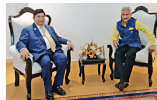
Foreign Minister AK Abdul Momen with India's External Affairs Minister S Jaishankar at a meeting yesterday.