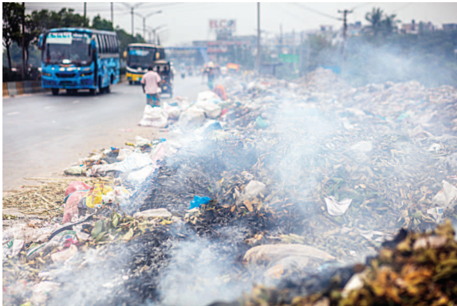
Along the Dhaka-Aricha highway, an alarming sight unfolds as garbage is set ablaze, enveloping the surroundings in a cloud of suffocating black smoke. The toxic emissions taint the air, threatening the health of nearby communities, and casts a cloak that reduces visibility -- resulting in an increased risk of road accidents. This photo was taken recently in Savar's Ganda area.