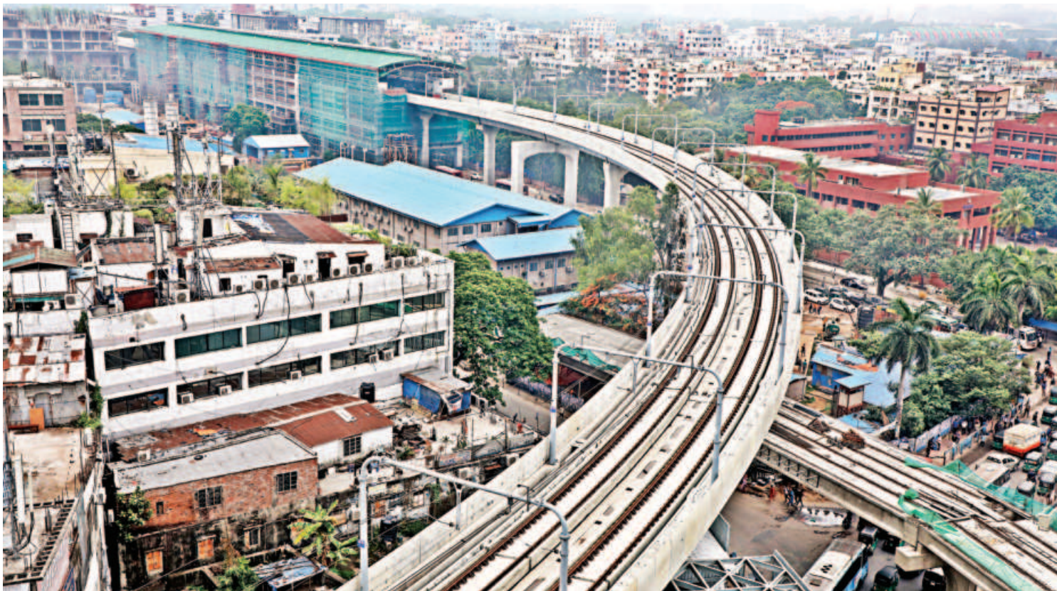
A section of the country's first electricity-powered metro rail spanning 21.26 kilometres from Uttara to Kamalapur in the capital which is being built at a cost of Tk 33,472 crore, some about 60 per cent of which is being provided by Japan in soft loans. Once complete, Mass Rapid Transit (MRT) Line-6 will be capable of carrying around 4.83 lakh people a day. A single trip will take 38 minutes, down from at least two hours on other modes of transport. A 12-km section from Uttara to Agargaon has been initially opened in December last year. Another section from Agargaon to Motijheel is expected to be inaugurated in November this year whereas the remaining portion by June 2025. The photo was taken at Farmgate on Sunday.