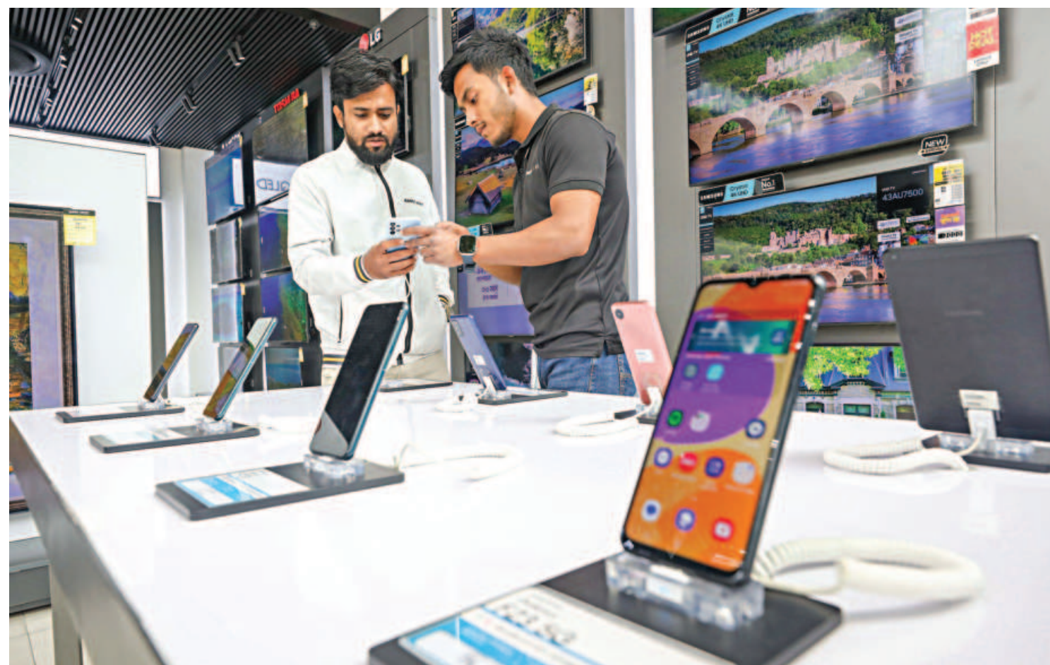
Sales of mobile phones dropped more than 40 per cent year-on-year in the first quarter of 2023. People in the industry blame a rise in import costs for the taka's depreciation against the US dollar, challenges in opening letters of credit for a shortage of the greenback and high inflation reducing the purchasing power of smartphone enthusiasts.