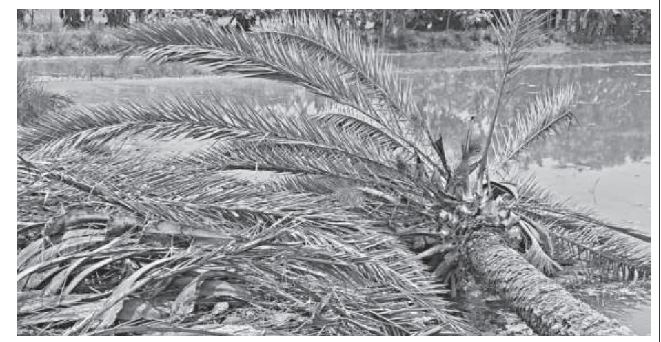
At least 150 trees like this one were felled in Patuakhali's Bauphal upazila recently as part of a road expansion project.

said, "Some trees had to be chopped felled for the reconstruction of this road. We are already done with the works and