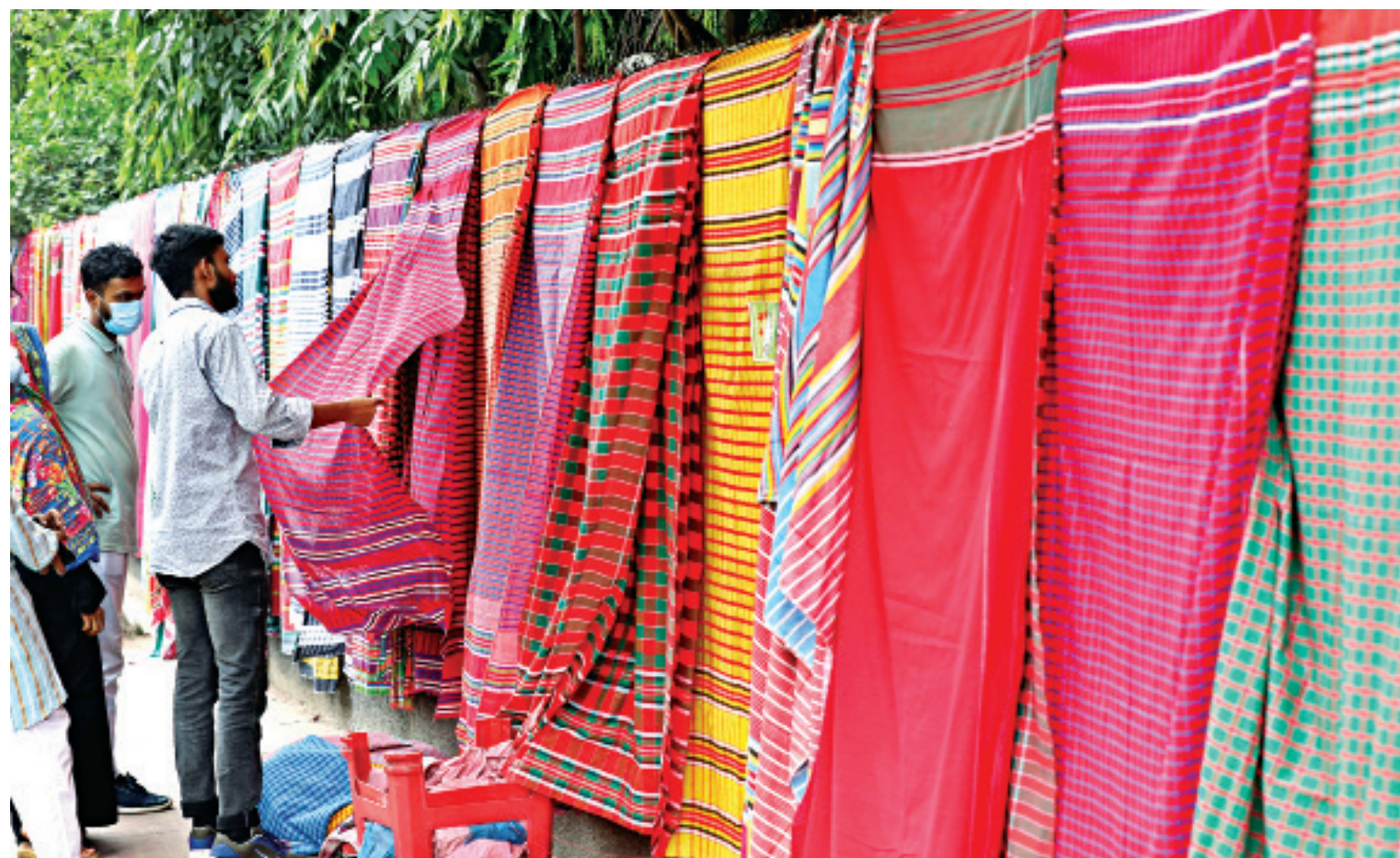
Thin rectangular pieces of cotton fabric, called "gamchha" in Bangla and traditionally used as a towel, hung by the footpath in Shyamoli in Dhaka for sale at up to Tk 250 each. Nowadays it is also used in making saris, accessories and home decorations. The photo was taken yesterday.