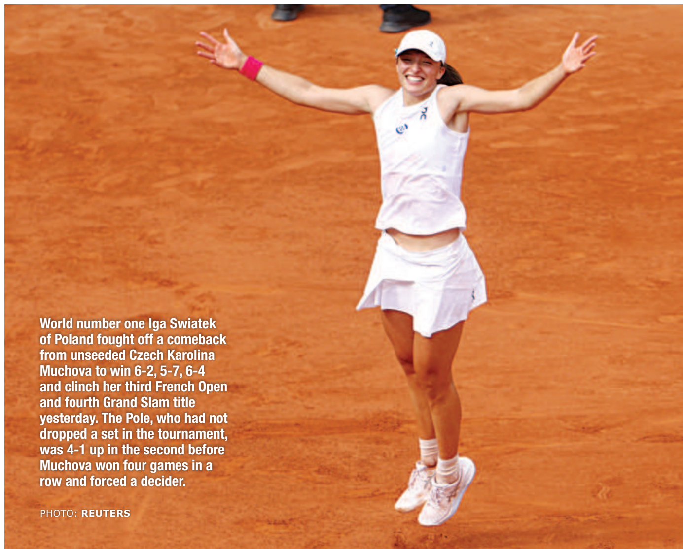
World number one Iga Swiatek of Poland fought off a comeback from unseeded Czech Karolina Muchova to win 6-2, 5-7, 6-4 and clinch her third French Open and fourth Grand Slam title yesterday. The Pole, who had not dropped a set in the tournament, was 4-1 up in the second before Muchova won four games in a row and forced a decider.