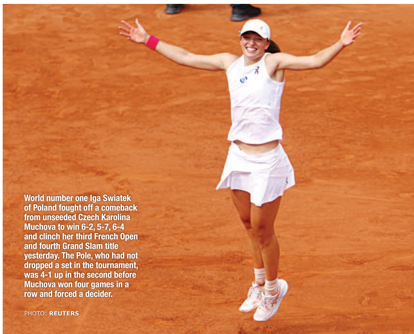
World number one Iga Swiatek of Poland fought off a comeback from unseeded Czech Karolina Muchova to win 6-2, 5-7, 6-4 and clinch her third French Open and fourth Grand Slam title yesterday. The Pole, who had not dropped a set in the tournament, was 4-1 up in the second before Muchova won four games in a row and forced a decider.