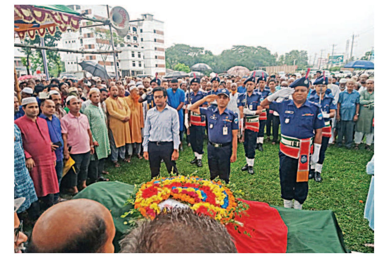
A guard of honour being given to Serajul Alam Khan at his ancestral village of Alipur in Begumganj upazila in Noakhali yesterday.

They gave an explanation as to why they held the examination despite students' requests of not doing so. The department also explained SEE PAGE 4 COL 2