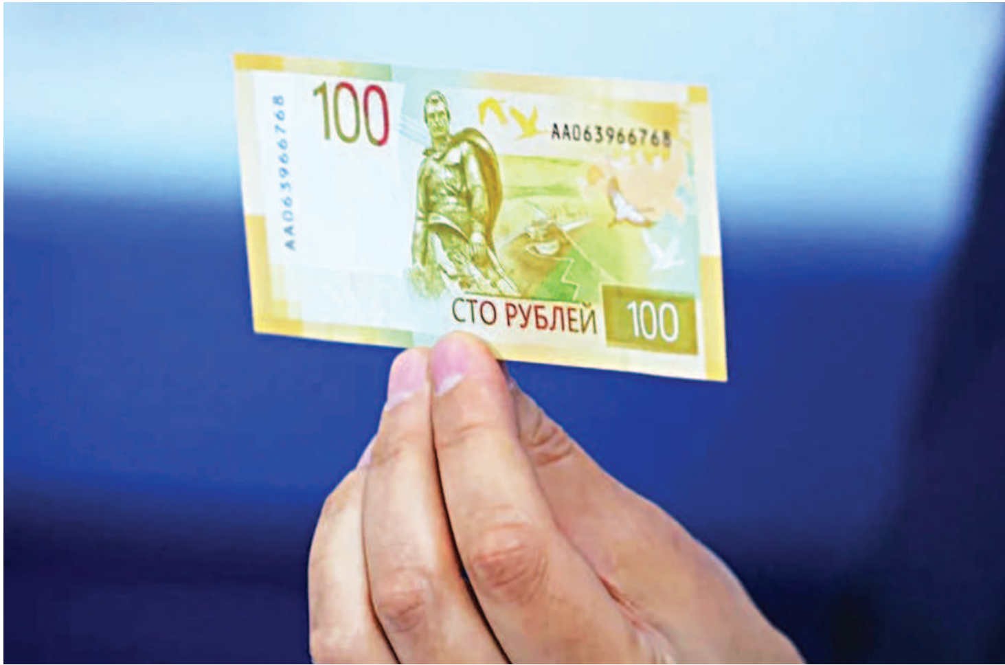
Deputy Governor of the Bank of Russia Sergey Belov holds the newly designed Russian 100-ruble banknote during a presentation in Moscow, Russia on June 30, 2022.