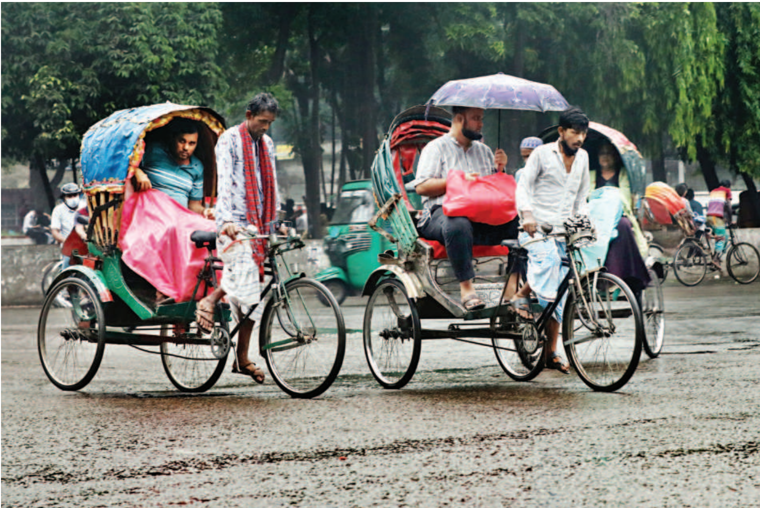
Rickshaw passengers try to stay dry during a drizzle yesterday afternoon that brought relief to the city dwellers who were suffering in the sweltering heat. There was light rain in different parts of the country too. The photo was taken near TSC at Dhaka University.