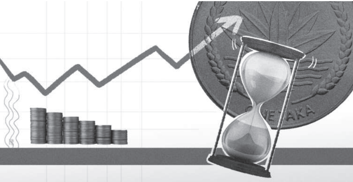
VISUAL: REHNUMA PROSHOON