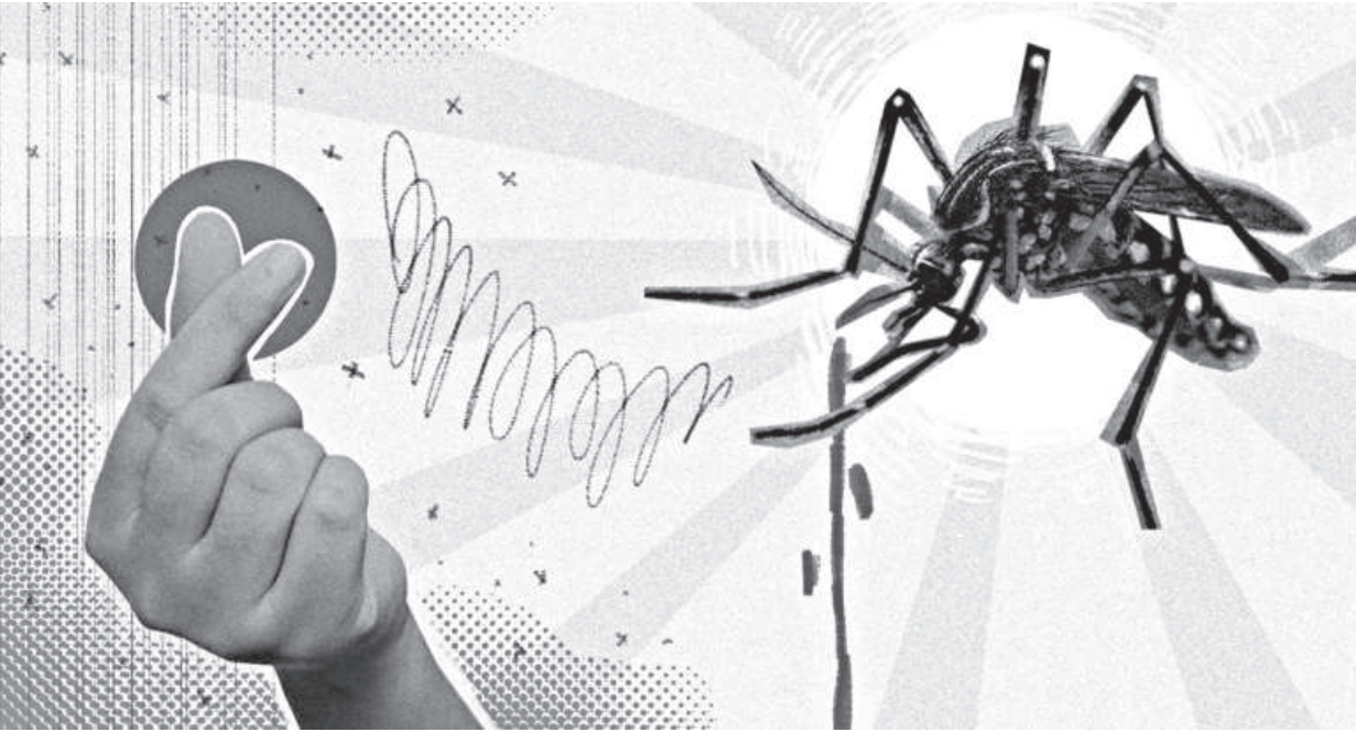
VISUAL: REHNUMA PROSHOON

alarming thought: are we becoming complacent regarding our love-hate living arrangement with mosquitoes? Every year, the news outlets conduct ritual coverage on dengue-related deaths and hospitalisations, and the city corporations come up with their laundry list of activities. I am calling it a laundry list out of politeness, because these activities seem to have done very little to contain mosquitoes or mosquito-borne diseases over the last few years. In the best case scenario, we get away with some irritating bites and hospitalisations. In the worst cases, we end up losing our loved ones to the deadly virus. Helpless, we stare as their eyes turn to stone, their