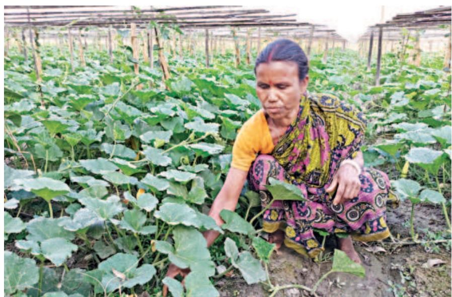
A woman takes care of her vegetable field at Kumrihat village in Lalmonirhat's Aditmari upazila.