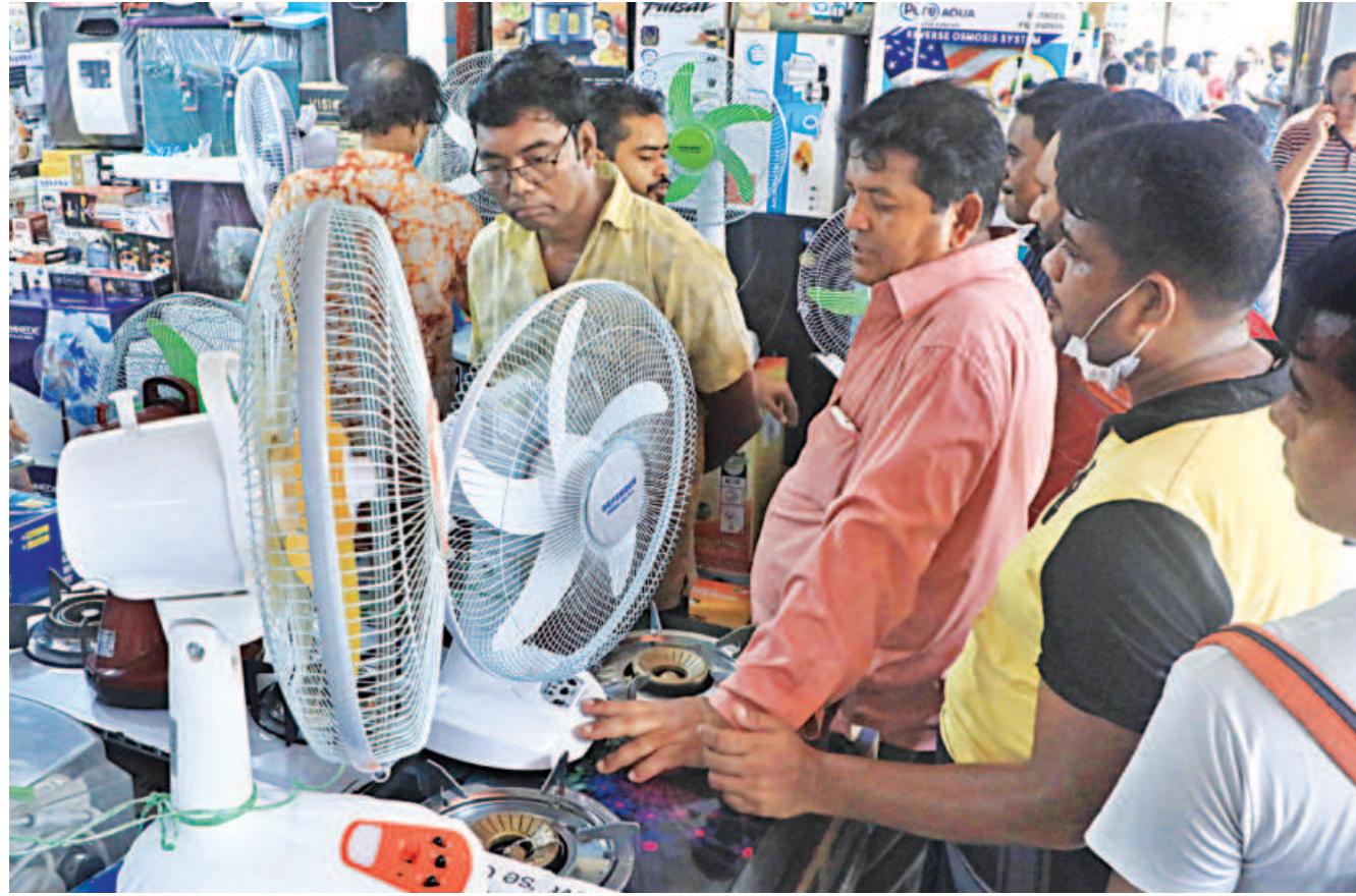
Customers check out rechargeable fans at a shop in the capital's Baitul Mukarram market yesterday. With the city experiencing frequent power cuts amid the searing heat, demand for rechargeable fans has surged, leading to rise in their prices by at least Tk 100 each.