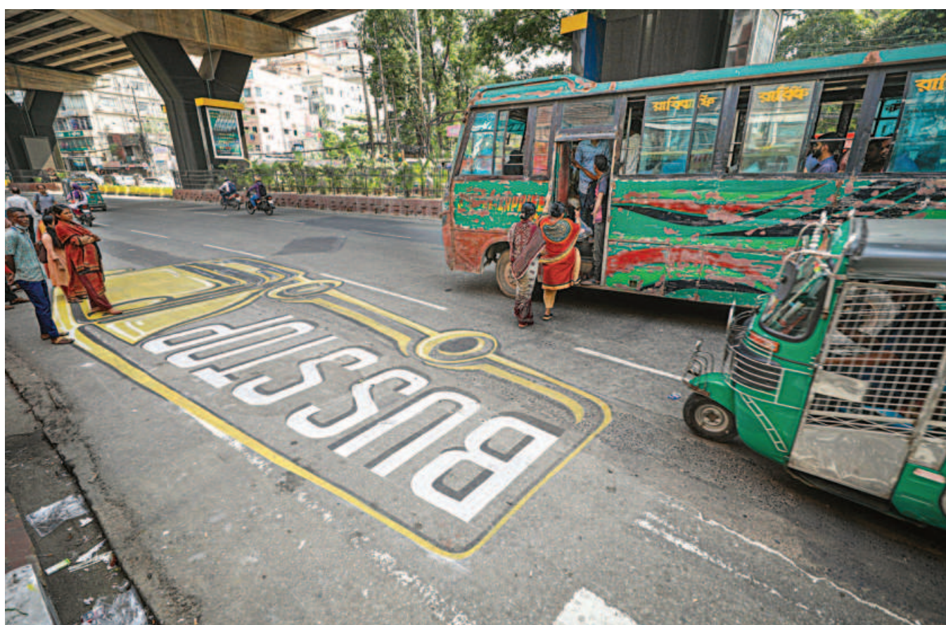
The traffic (north) division of Chattogram Metropolitan Police has drawn on the asphalt where a bus must stop to pick up passengers in the port city's Sholosahar Gate-2 area. People are seen in this photo taken on Sunday getting on a bus that stopped on the middle lane.