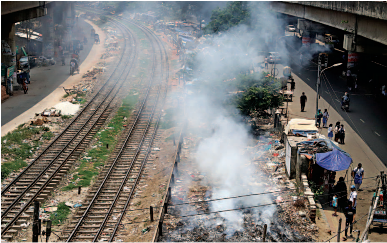
Dumped waste being burned next to the rail tracks in the capital's Khilgaon Railgate area yesterday. All the smoke and stench diffused from burning garbage is not only undesirable, but also harmful to public health. Besides, the carbon emission from the non-biodegradable waste contributes to air pollution. Today is World Environment Day.

Meanwhile, lawyer Ahsanul Karim, representing the brick kiln owners, said operations of the brick kilns cannot be shut down as their applications for selecting place for relocation were not disposed of yet.