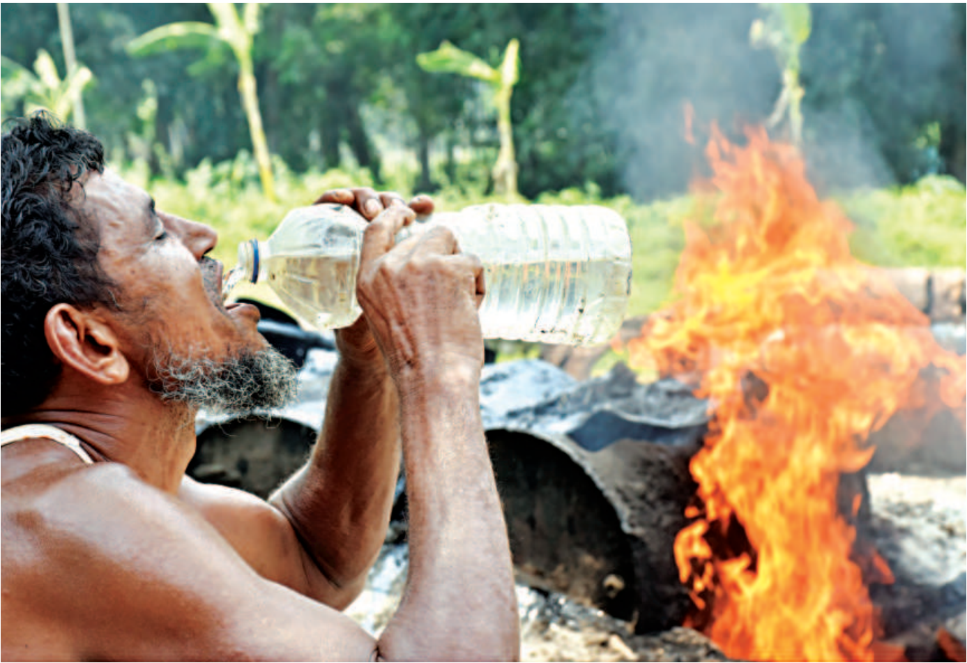
An exhausted worker takes a break from heating tar to drink water in Barishal city's Chohota area yesterday. The searing heat over the last few days has made life outdoors difficult in many parts of the country.

Fakhrul said the government must step down immediately and dissolve parliament by handing over power to an impartial caretaker government, paving the way for holding a free and fair and free election. "That is the only way to overcome this crisis and save the nation."