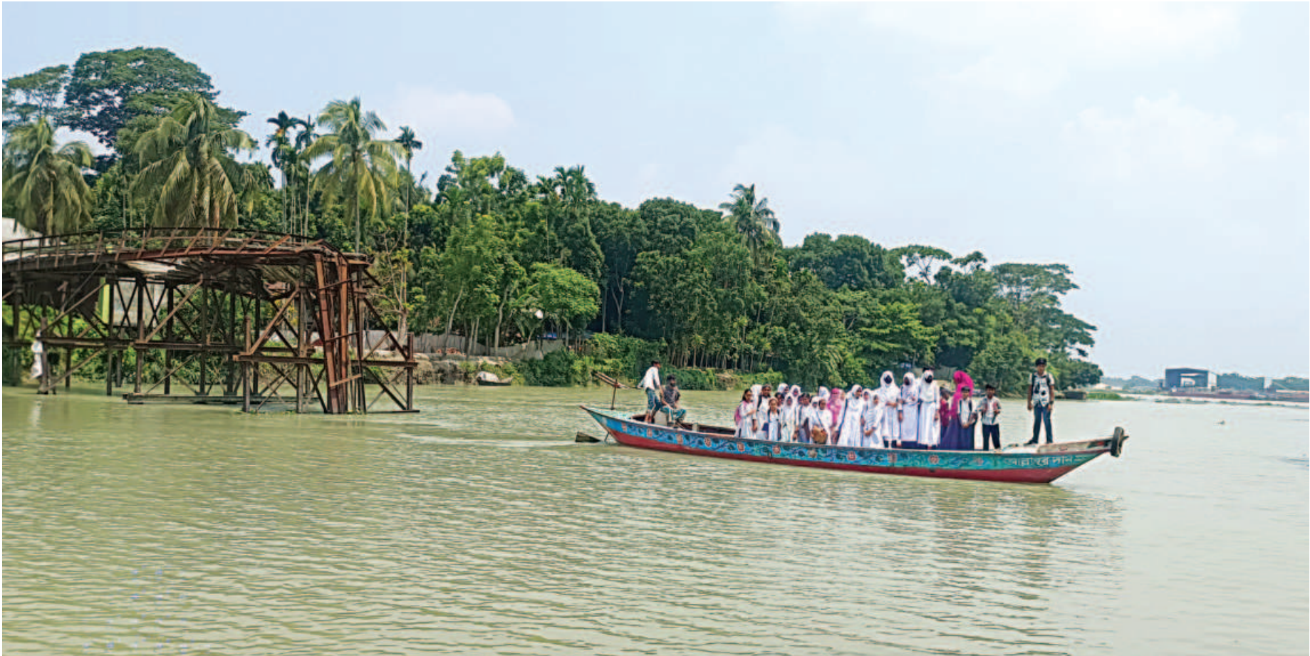
Children cross the Lebukhali Bharani canal in Patuakhali's Dumki upazila by a boat to go to their school as the iron bridge, which collapsed about three years ago after being hit by a sand-laden boat, remains unrepaired. The local LGED office is designing a new bridge, but the schoolchildren don't know when their suffering will end. The photo was taken on Tuesday.