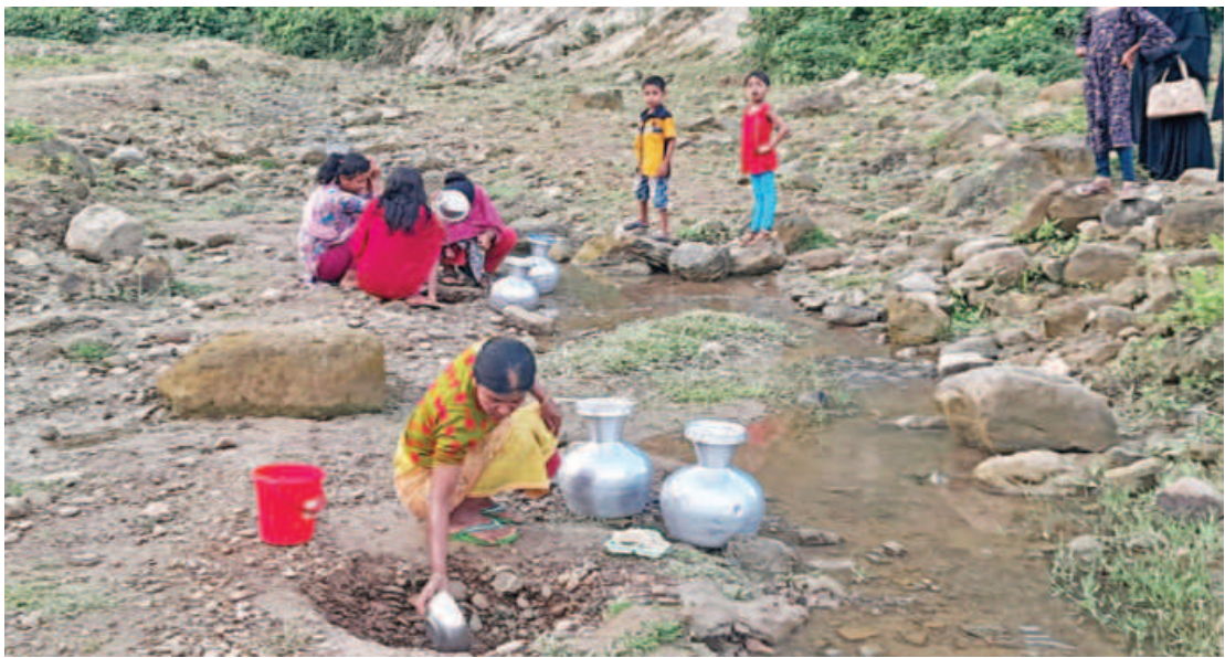
Some women from the indigenous community collect water from a drying up spring at Chandringa Betgara village in Netrakona’s Kalmakanda upazila.

This newspaper could not reach the officials of MH Trade International for comments.