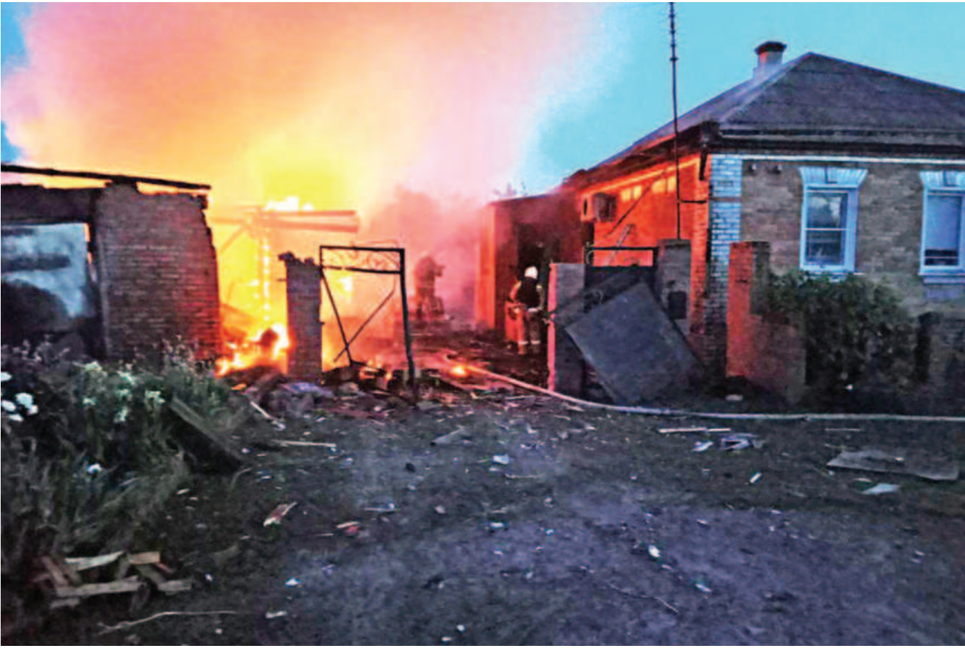
Firefighters work at a house on fire following a shelling, which, according to the regional governor, was carried out by Ukrainian forces, in the village of Sobolevka, Belgorod region, Russia. The photo was captured on Friday.