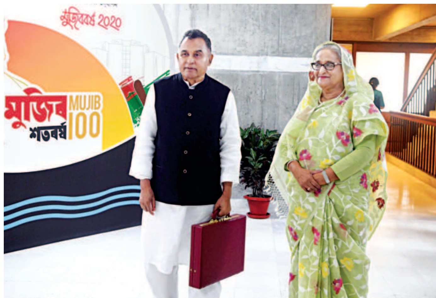
With Prime Minister Sheikh Hasina walking beside him, Finance Minister AHM Mustafa Kamal heads towards the parliament chamber to deliver his budget speech.