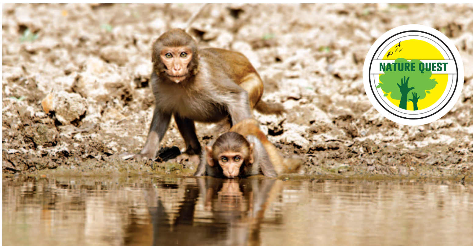
THE RHESUS' RECESS ... A mother rhesus macaque and her infant taking a quick drink at a watering hole in Habiganj's Satchhari National Park. The most widely distributed primates in the world, rhesus macaques prefer living in spaces with trees, as they are arboreal and mostly herbivorous. But these highly intelligent animals have become so accustomed to living with humans that they can be seen frequently in "concrete jungles" as well. They move in large troops comprising 20-200 primates, and the mothers spend most of their time rearing their young and preparing them for independence. Due to their wide availability, and anatomical and physiological similarities to humans, these monkeys have been used extensively in medical and biological research, and have also facilitated many scientific breakthroughs. Their survival remains crucial for humans and the environment, and the protection of forests and waterbodies is imperative for them to thrive.