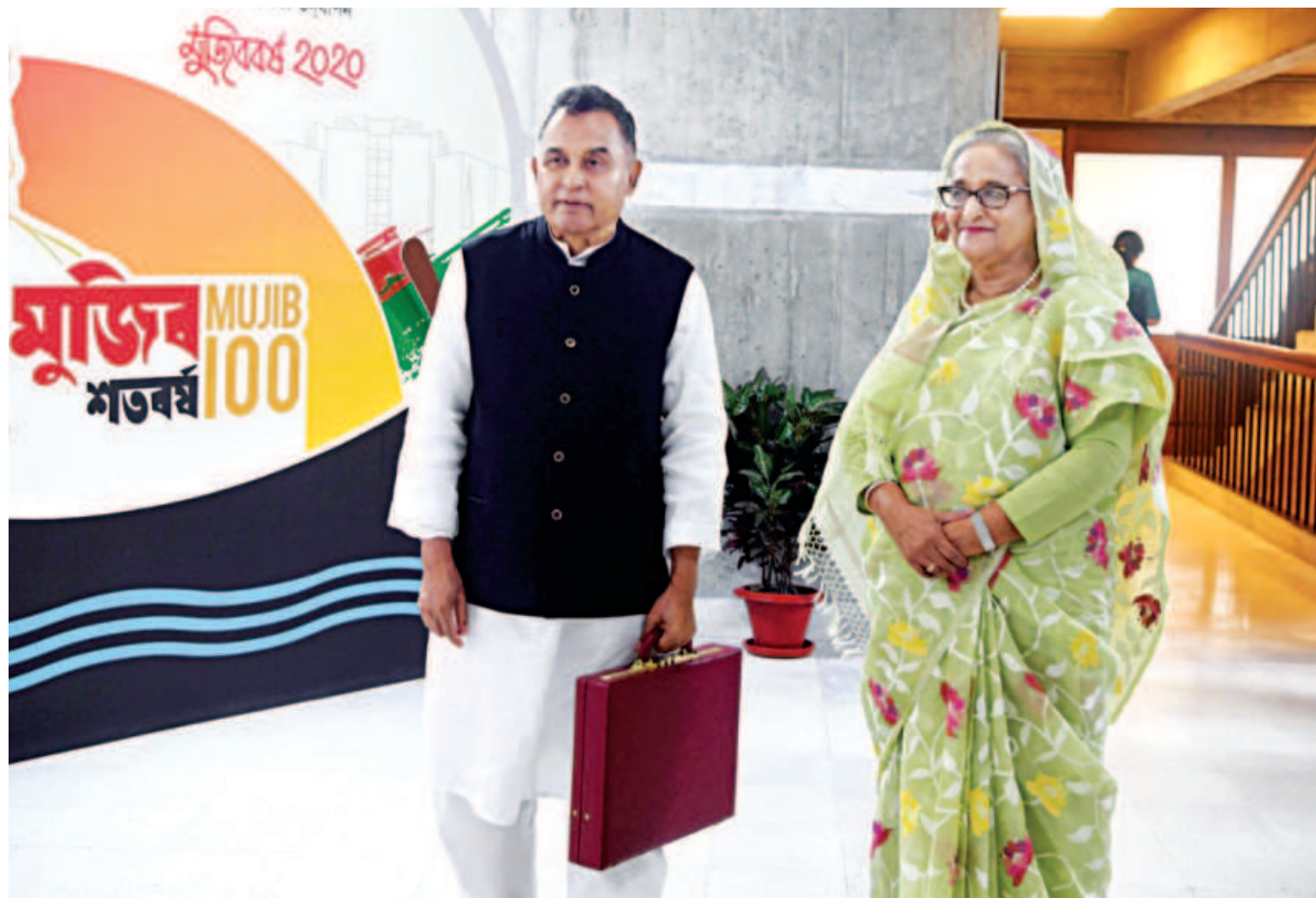
With Prime Minister Sheikh Hasina walking beside him, Finance Minister AHM Mustafa Kamal heads towards the parliament chamber to deliver his budget speech.

Prime Minister's Press Wing said SEE PAGE 13 COL 1