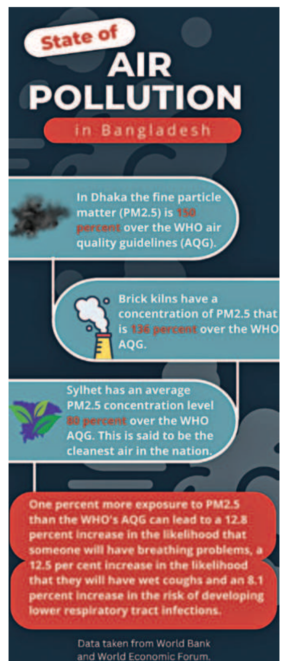
INFOGRAPH: SYEDA AFRIN TARANNUM

Sumaiya is just trying to make it through each day; give her toxic positivism at sumrashid10@gmail.com