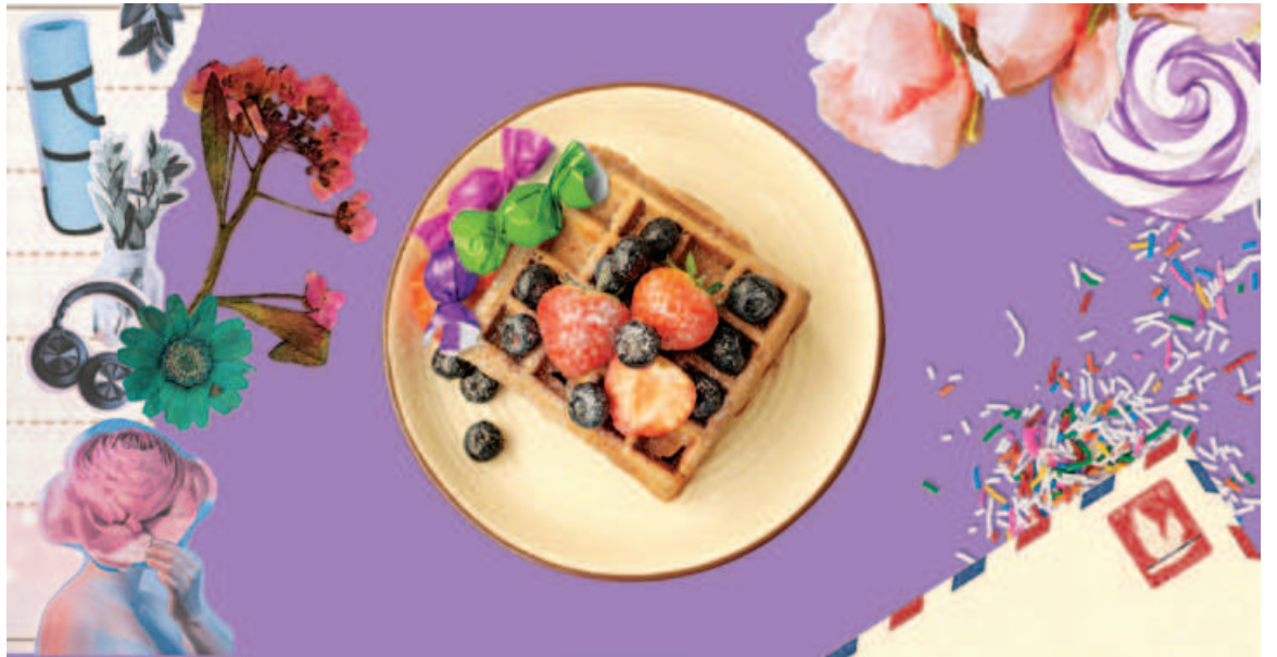
ILLUSTRATION: FATIMA JAHAN ENA