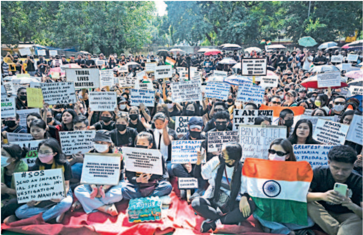
Activists of the All Tribal Students Union Manipur (ATSUM) hold placards during a protest amid ongoing ethnic violence in India's northeastern Manipur state, in New Delhi, India yesterday.