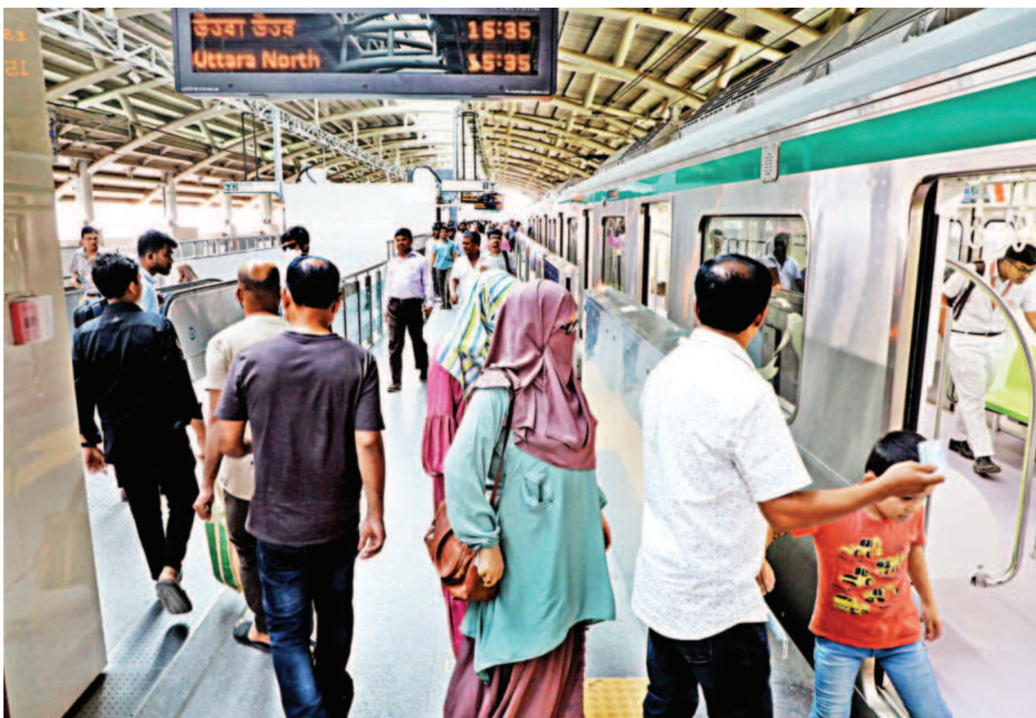
People getting on the metro rail at Agargaon station yesterday. From now on the metro rail will run from 8:00am to 8:00pm six days a week. As per the new schedule, weekly closure will be changed from Tuesday to Friday.

"Although the temperature is mild in the morning, it gets hotter as the day progresses," he added.