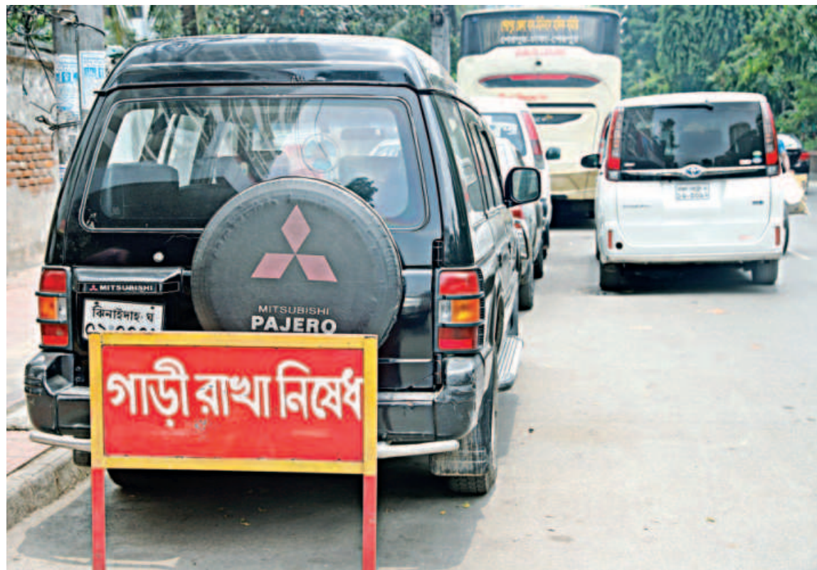
Ignoring a sign that reads "No Parking", an array of cars can be seen parked on a road near the Dainik Bangla intersection in the capital's Motijheel area. This photo was taken recently.

"They (govt) are hindering people's freedom to dissent and the right to vote by applying excessive force to establish a one-party rule," he added.