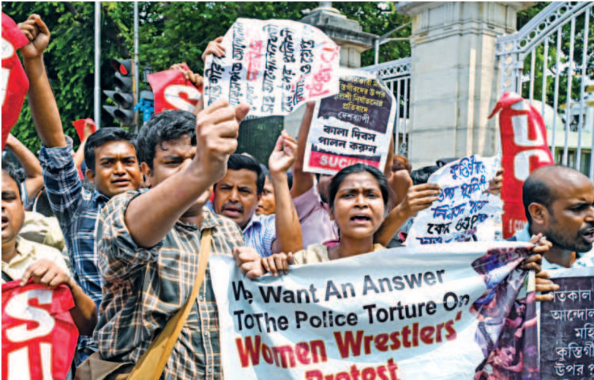
Activists of Socialist Unity Centre of India (SUCI) shout slogans as they demonstrate to support the Indian wrestlers' atrocities whilst they protest against Brij Bhushan Singh, the wrestling federation chief over allegations of sexual harassment and intimidation, in Kolkata, India yesterday.

REUTERS, Abuja Bola Tinubu was sworn in as Nigeria's president yesterday following a disputed election and facing pressure to quickly improve economic and security conditions, which many complain worsened under his predecessor Muhammadu Buhari. Tinubu was sworn in at a ceremony at Eagles Square, in the capital Abuja, attended by local and foreign dignitaries. Two of Tinubu's main opponents in the February election are challenging his victory on the basis of fraud claims. A tribunal will start today to hear their main arguments, with a ruling not expected before September. Buhari, a taciturn former military ruler, leaves Africa's biggest economy and most populous nation deeply divided. The election had galvanised young voters hoping for a break from the two parties that have dominated Nigerian politics since military rule ended in 1999.