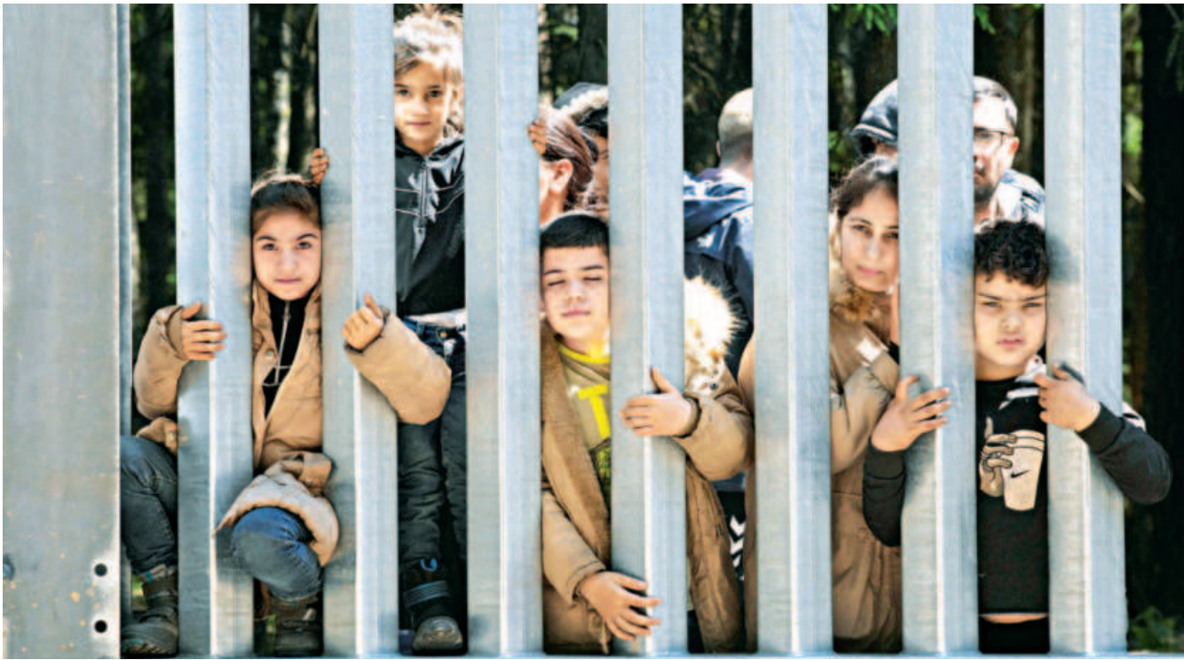
Migrants stand near the wall on Polish-Belarusian border near Bialowieza, Poland yesterday. A group of migrants, including women and children, are stuck at the border with Belarus, Poland's border guard said yesterday as activists accused the officers of not letting migrants plead for asylum.

REUTERS, Tokyo Japan put its ballistic missile defences on alert yesterday, vowing to shoot down any projectile that threatened its territory after North Korea notified it of a satellite launch between May 31 and June 11. The nuclear-armed North says it has completed its first military spy satellite and leader Kim Jong Un has approved final preparations for the launch. It would be the North's latest step in a series of missile launches and weapons tests in recent months. Japan expects North Korea to fire the rocket carrying its satellite over the southwest island chain as it did in 2016, a defence ministry spokesperson said.