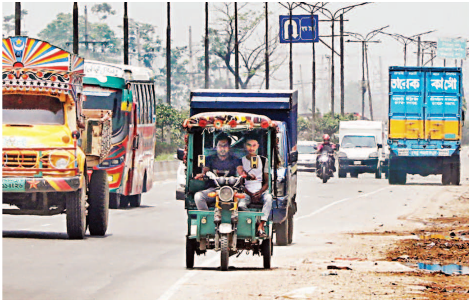
A slow-moving three-wheeler plies the Dhaka-Aricha highway, while a container-carrying truck moves in the opposite direction on the same road. The situation narrates the ever-present threats on the highway, and the authority's lack of intervention in the matter, leading to the possibility of an accident. This photo was taken in Savar's Hemayetpur area recently.