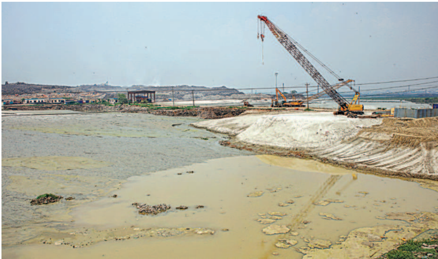
Land development is going on to set up a waste-fuelled power plant in the capital's Aminbazar landfill. The plant will produce 42.5 megawatts of electricity every day using about 3,000 tonnes of waste collected from the Dhaka North City Corporation area. The photo was taken yesterday.