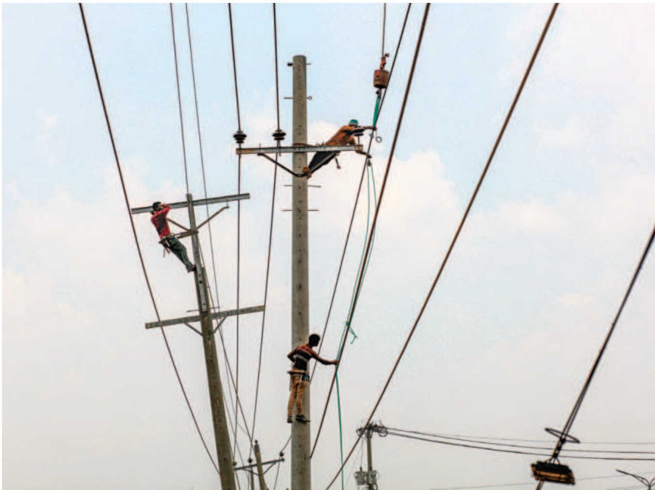
Electricians installing wires on electric poles along the Dhaka-Aricha highway in Savar's Boilapur area yesterday. None of the three in this photo are wearing safety helmets.